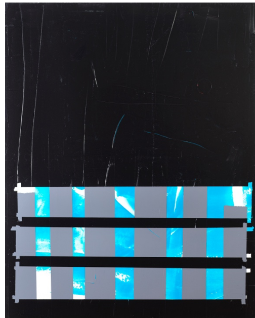
Tariku Shiferaw War/No More Trouble (Bob Marley) 2017 Acrylic on canvas 153 x 122 cm

PLEASE NOTICE THE COPYRIGHT. By using the following images, the recipient agrees to the terms of usage. The reproduction of the images at a later point in time is only possible in agreement with the author, which needs to be stated in written form. By reproducing these images, the terms of usage are automatically agreed upon.