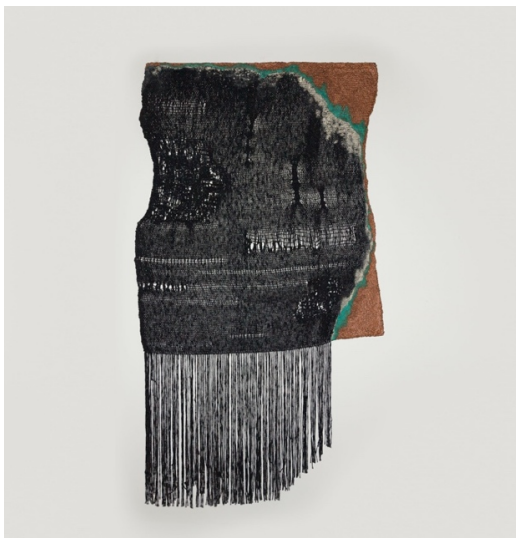
Luam Melake Recovery 2016 Polyamide and cotton fiber, copper, patina, cement 124.5 x 68.6 cm