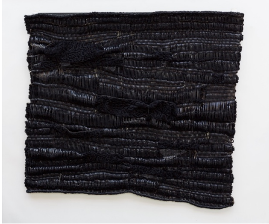
Luam Melake Black 2017 Vinyl, Persian lamb fur, cotton drawstring cord, asphalt 71 x 80 cm

IMAGE DOWNLOAD LINK: https://we.tl/BMxn6tyMFU