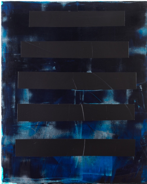
Tariku Shiferaw Grinding All My Life (Nipsey Hussle) 2018 Acrylic on canvas 153 x 122 cm