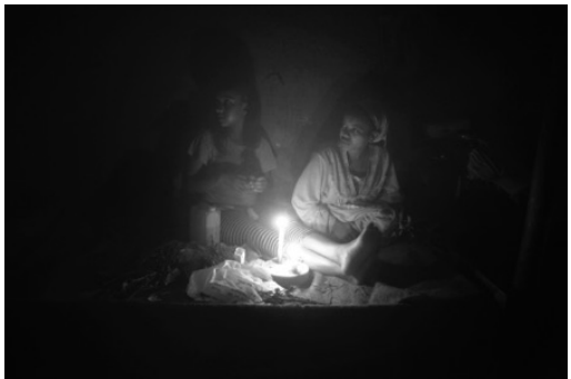
Michael Tsegaye Working Girls II, XXI 2009 Digital archival print 60x90 cm