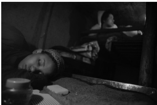
Michael Tsegaye Working Girls II, XI 2009 Digital archival print 60x90 cm