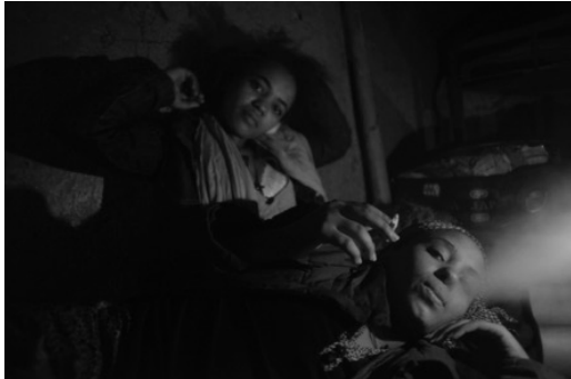
Michael Tsegaye Working Girls II, IX 2009 Digital archival print 60x90 cm

IMAGE DOWNLOAD LINK: https://we.tl/cgnXkPQqqp