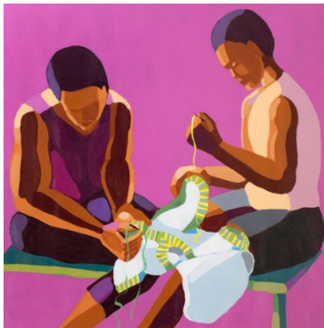
Nirit Takele Two men sewing a dress , 2018 20 x 20 cm Acrylic on paper