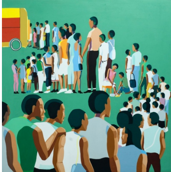
Nirit Takele Addis Line , 2018 100 x 100 cm Acrylic on canvas

IMAGE DOWNLOAD LINK: https://we.tl/t-9i5P4TwNI6