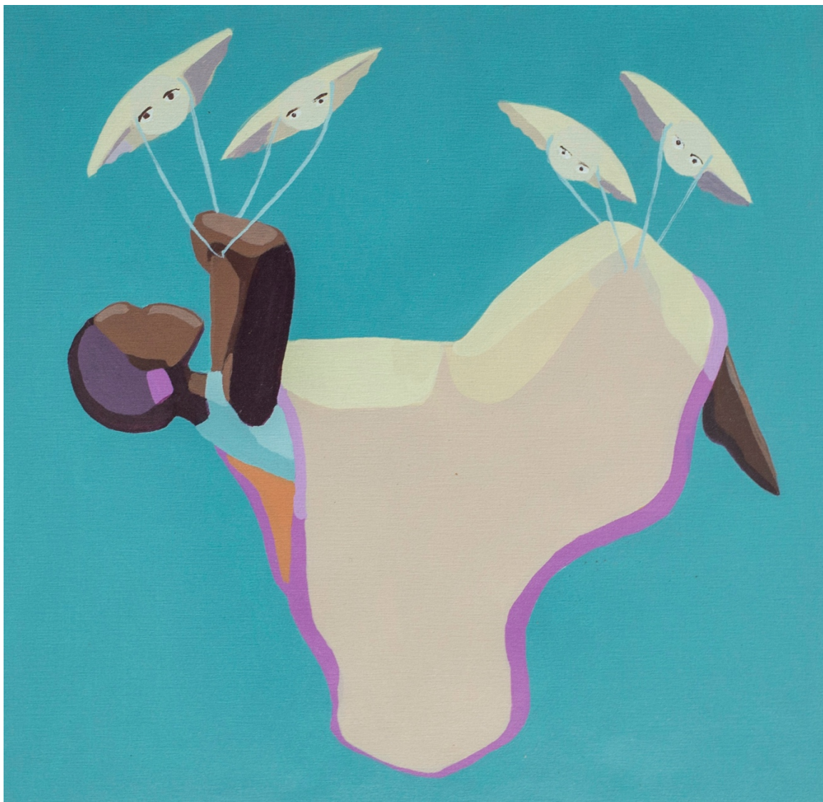
Nirit Takele, Flying with Angels , 2018 Acrylic on Paper 20x20 cm

Addis Fine Art Project Space, 47-50 Margaret Street W1W 8SB, London