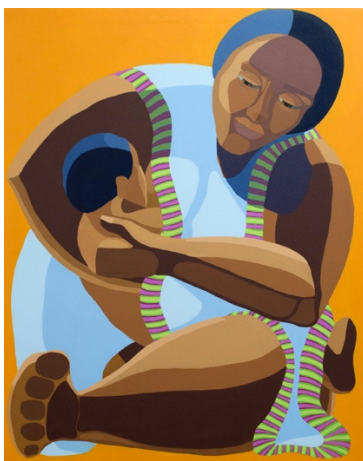
Nirit Takele Mother with child , 2018 70 x 55 cm Acrylic on canvas