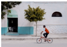
Girma Berta Asmara XVI, 2018 Digital Archival Print 45 x 60 cm Edition of 7 plus 1 AP (GIBE0084)