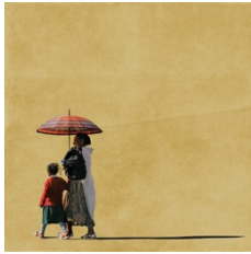
Girma Berta Moving Shadows II, IV, 2017 Digital Archival Print 40 x 40 cm Edition of 7 plus 1 AP (GIBE0051)

IMAGE DOWNLOAD LINK: https://bit.ly/2HN5gFI