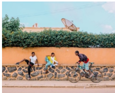
Girma Berta Asmara I, 2018 Digital Archival Print 45 x 60 cm Edition of 7 plus 1 AP (GIBE0068)