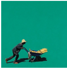
Girma Berta Moving Shadows II, VI, 2017 Digital Archival Print 40 x 40 cm Edition of 7 plus 1 AP (GIBE0053)