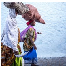
Eyerusalem Jirenga The City of Saints X, 2017 Digital Archival Print 80 x 80 cm Edition of 7 plus 1 AP (EYJI0010)

PLEASE NOTICE THE COPYRIGHT. By using the following images, the recipient agrees to the terms of usage. The reproduction of the images at a later point in time is only possible in agreement with the author, which needs to be stated in written form. By reproducing these images, the terms of usage are automatically agreed upon.