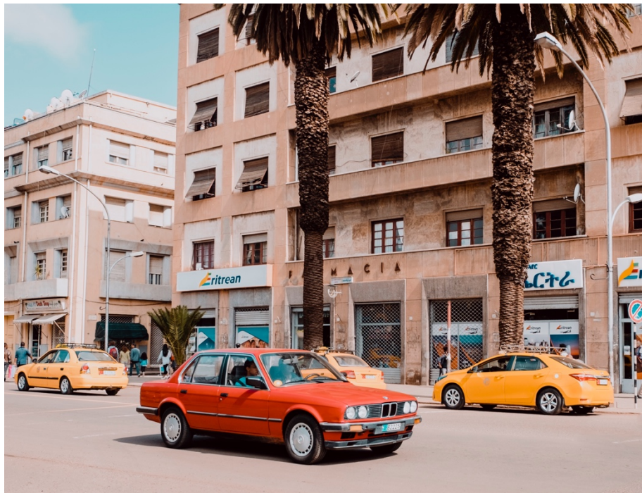
Girma Berta, ASMARA VII, 2018 Digital Archival Print 45 x 60 cm Edition of 7 plus 1 AP

Addis Fine Art Gallery, 3rd Floor Woldfiker Building, Bole Medhane Alem Addis Ababa, Ethiopia