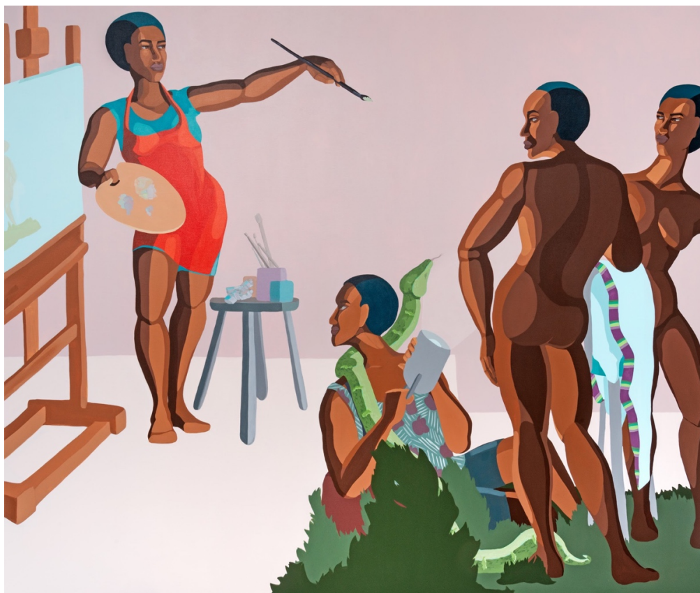
Studio Visit Adam & Eve, 2019 160 x 190 cm, Acrylic on Canvas

1-54 Contemporary African Art Fair New York | Booth B07 Industria, West Village, NYC 3 - 5 May 2019