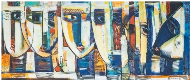
Lulseged Retta Birile , 2019 Acrylic on canvas 80 x 190 cm

IMAGE DOWNLOAD LINK: https://we.tl/t-FhYktoZbka