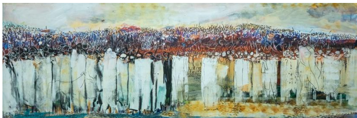
Lulseged Retta Celebration , 2017 Acrylic on canvas 60 x 180 cm