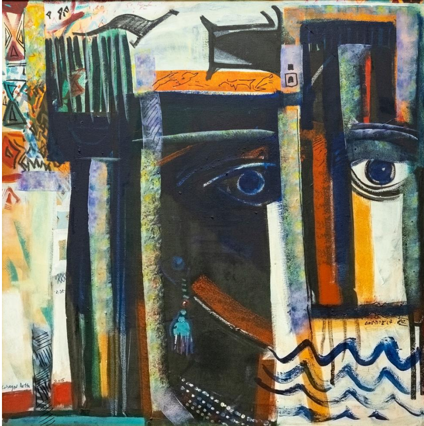
Forseeing , 2017, Acrylic on canvas, 100 x 100 cm