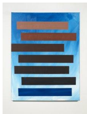
Tariku Shiferaw Sky Walker (Miguel) , 2021 Acrylic on canvas