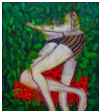
Selome Muleta Tsédal XI , 2020 Acrylic and oil pastel on canvas