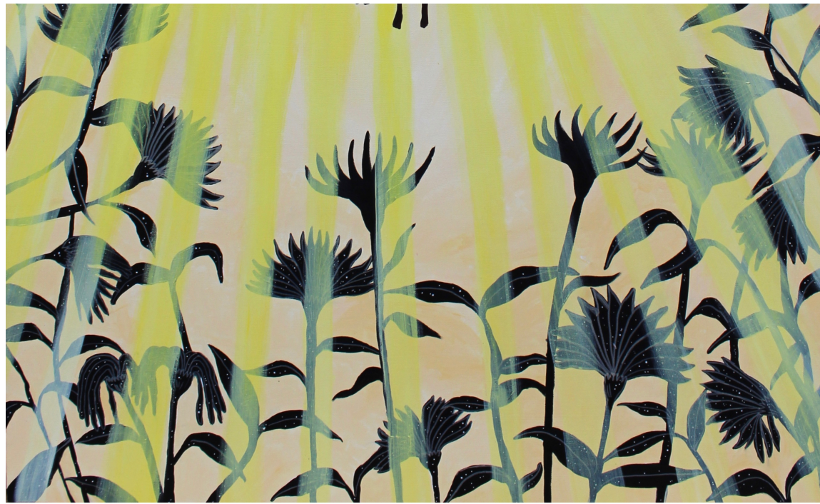
When splendour raptures (The Inner Life series), 116 cm x 89 cm, Mixed medium and collage on canvas, 2015 © Daniela Yohannes, Courtesy of the artist.