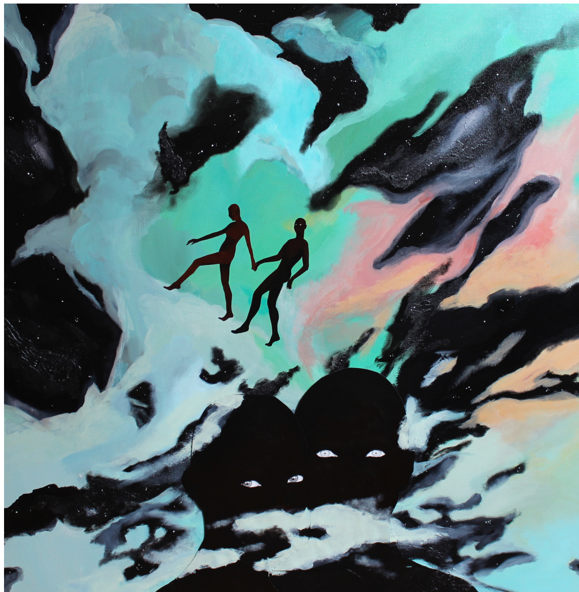
The Kingdom , 92 cm x 92 cm, Mixed medium on Canvas, 2013 © Daniela Yohannes, Courtesy of the artist.