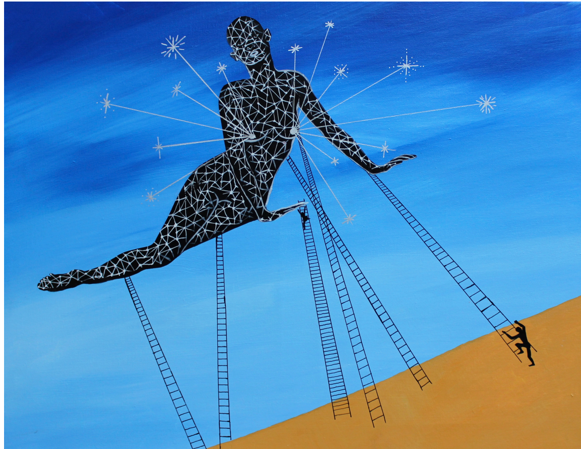
Nipples and stars (The Inner Life series), 50 cm x 64 cm, Mixed medium and collage on linen, 2015 © Daniela Yohannes, Courtesy of the artist.