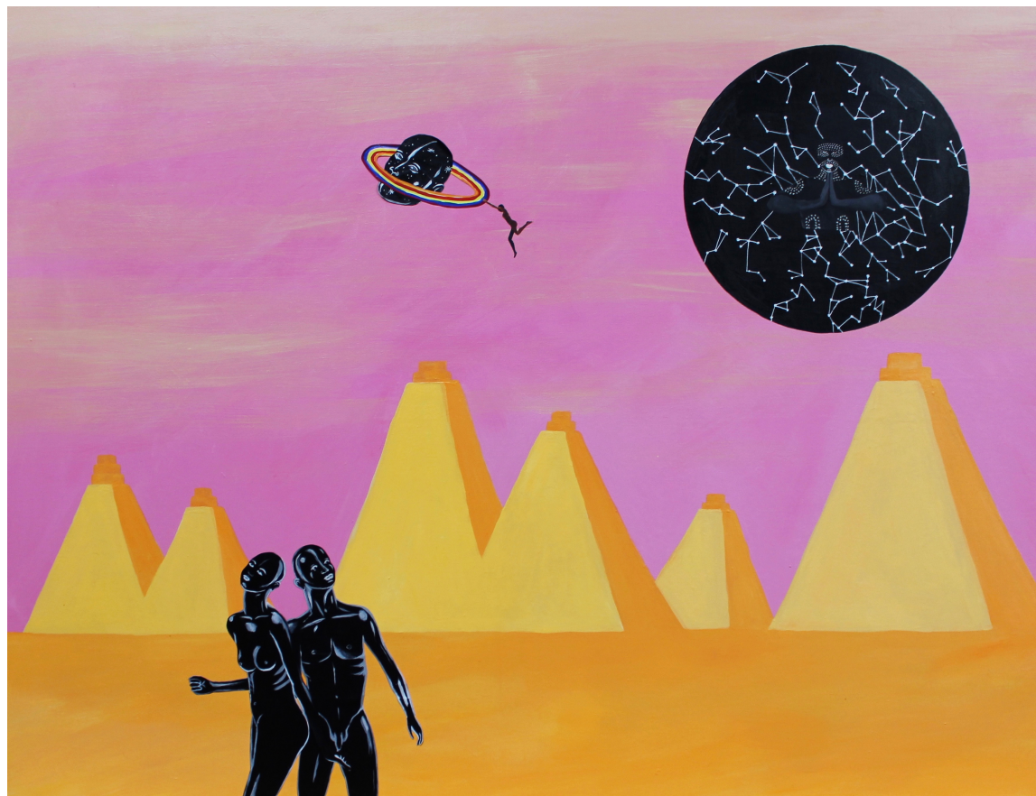
Untitled (The Inner Life series), 116 cm x 89 cm, Mixed medium and collage on linen, 2015 © Daniela Yohannes, Courtesy of the artist.