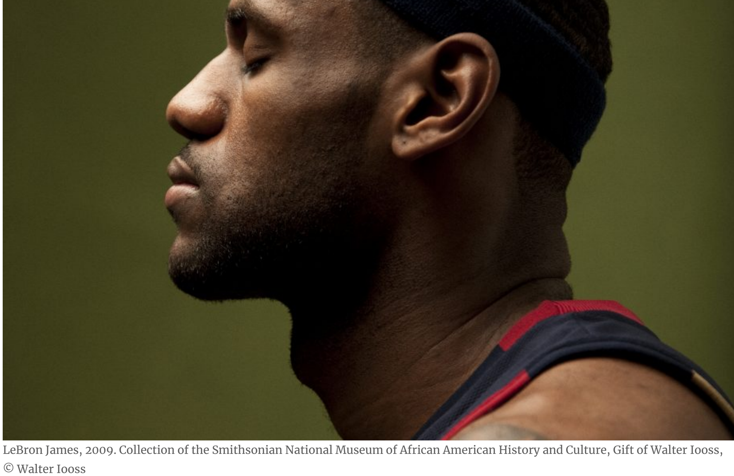
LeBron James, 2009. Collection of the Smithsonian National Museum of African American History and Culture, Gift of Walter Iooss, © Walter Iooss