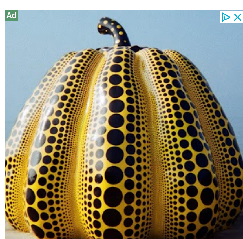
Naoshima & Himeji, Miyajima