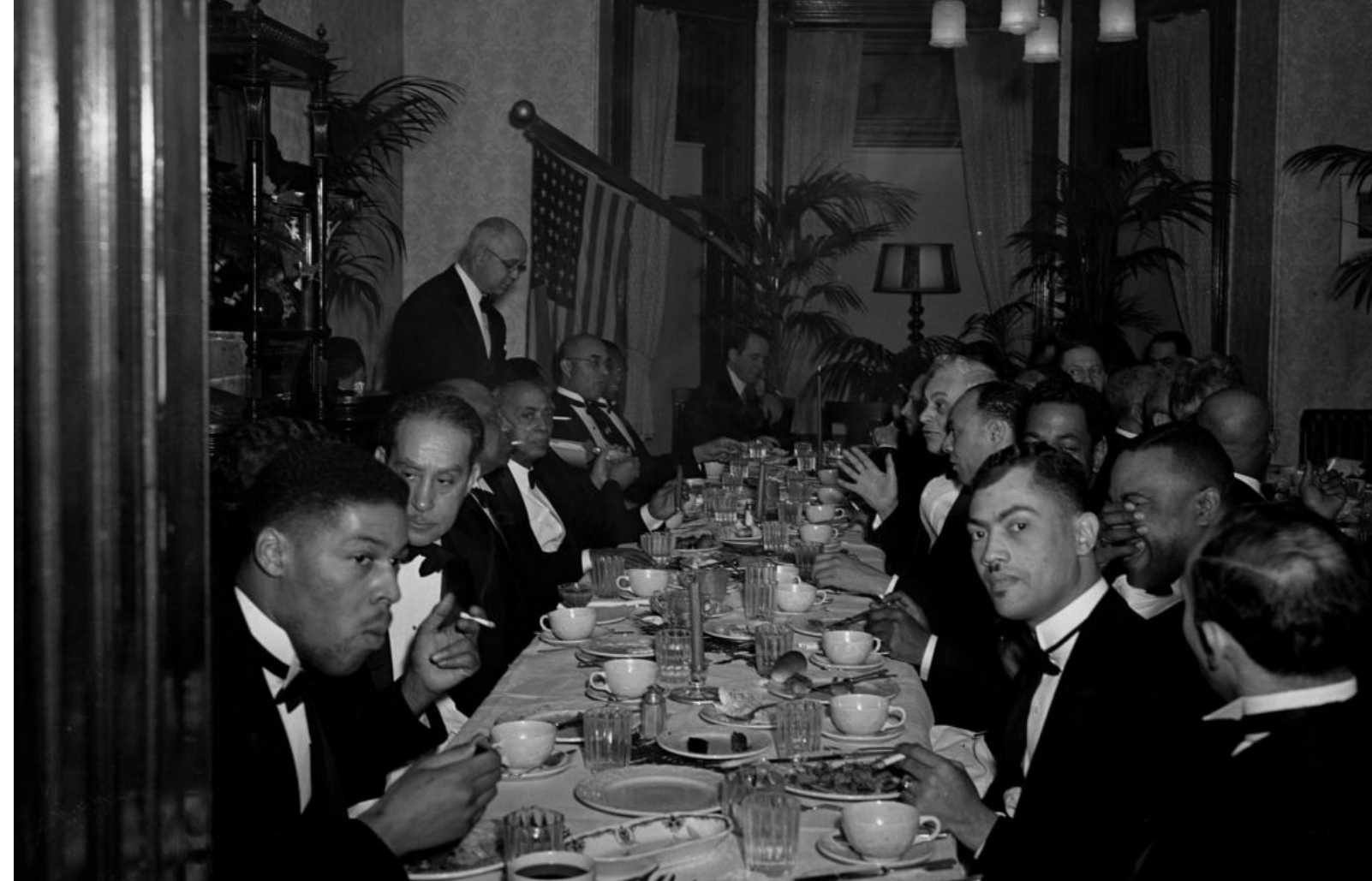
The Mu-So-Lit Club's Lincoln-Douglass Dinner, 1940.

In August, the Smithsonian will launch a long-term travelling exhibition highlighting African American men. Titled 'Men of Change: Power. Triumph. Truth.', the exhibition will feature men of colour who are historic and contemporary icons linked to US history. The exhibition will kick off its 10-city tour at Cincinnati's National Underground Railroad Freedom Center, an affiliate of the Smithsonian, on August 17 th and will then move from city to city over the course of three years.