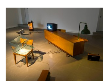
Beyond the Visual: The New Role of Noise