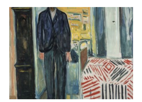
Edvard Munch: The Modern Eye at Tate Modern, London.