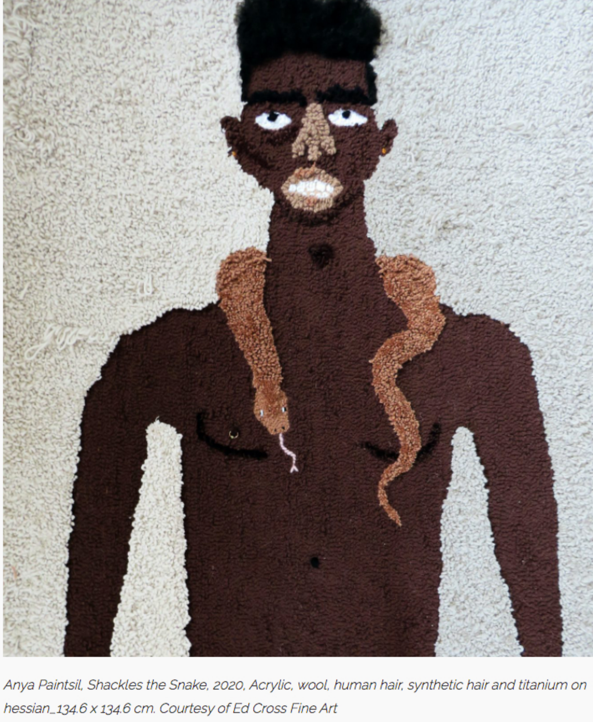
Anya Paintsil, Shackles the Snake , 2020, Acrylic, wool, human hair, synthetic hair and titanium on hessian, 134.6 x 134.6 cm.

1-54 is delighted will once again be partnering with Somerset House to present the first major UK retrospective of works by the celebrated late French-Moroccan photographer, video artist and activist Leila Alaoui, which will debut during 1-54 and run through to January 2021. A series of photographic works created between 2008 and 2014 will be presented alongside Leila Alaoui's final unfinished video work. Acclaimed for capturing and preserving the unseen stories of individuals and communities displaced by conflict and unrest, Leila Alaoui offers an intimate portrait into the rich cultural identities and resilience of societies facing difficult and uncertain realities. The subjects of Alaoui's works are pictured across the contemporary Mediterranean-landscape and beyond, from Syrian refugees fleeing civil war in Lebanon to young North Africans seeking an alternative future in Europe. Tragically, Alaoui was killed whilst working on a photography project for a women's rights campaign for Amnesty International in Burkina Faso in 2016. She was critically wounded during a terrorist attack in Ouagadougou, passing away from her injuries shortly afterwards at the age of 33.