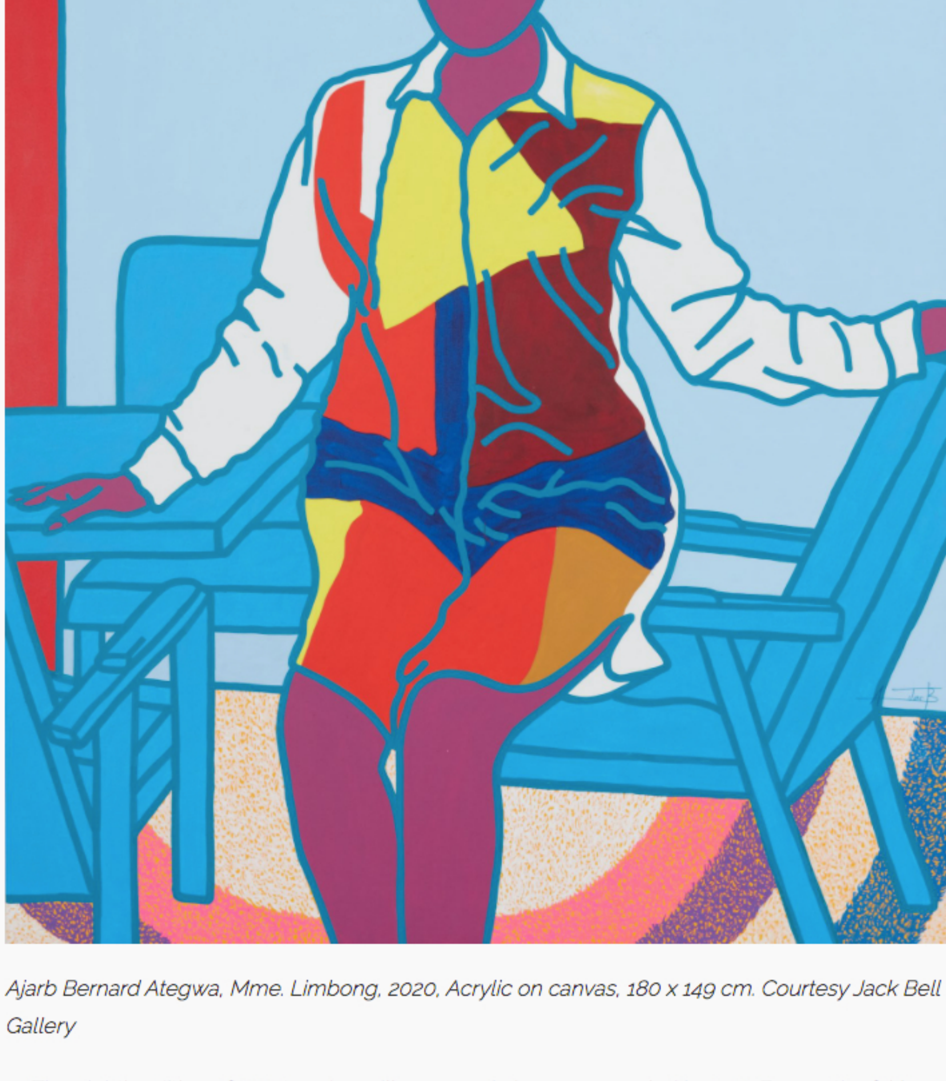
Ajarb Bernard Ategwa, Mme. Limbong , 2020, Acrylic on canvas, 180 x 149 cm.

Tickets are on sale now for the public day on Saturday 10th October, with 2-hour time slots available to book all day (10:00-20:00) online here .