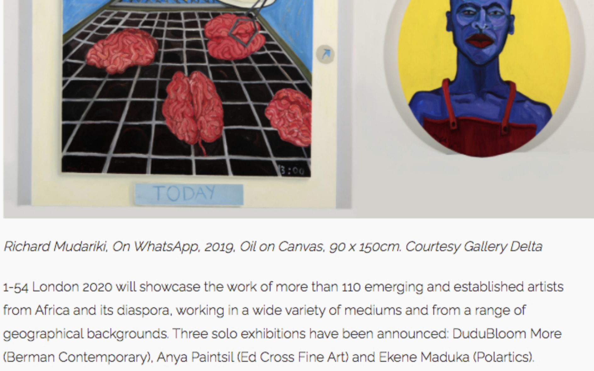
Richard Mudariki, On WhatsApp , 2019, Oil on Canvas, 90 x 150cm.

1-54 Contemporary African Art Fair opens tomorrow Thursday 8th October (8th & 9th preview days) with 36 exhibitors from 17 countries participating in a new blended online and offline model. All exhibitors will showcase work at 1-54 Online Powered by Christie's, with 29 exhibitors also bringing physical presentations to an intimate eighth London edition at Somerset House. As part of the Christie's partnership, there will also be a curated pop-up exhibition of works from all the Somerset House exhibitors on display at the auction house's Duke Street Gallery.