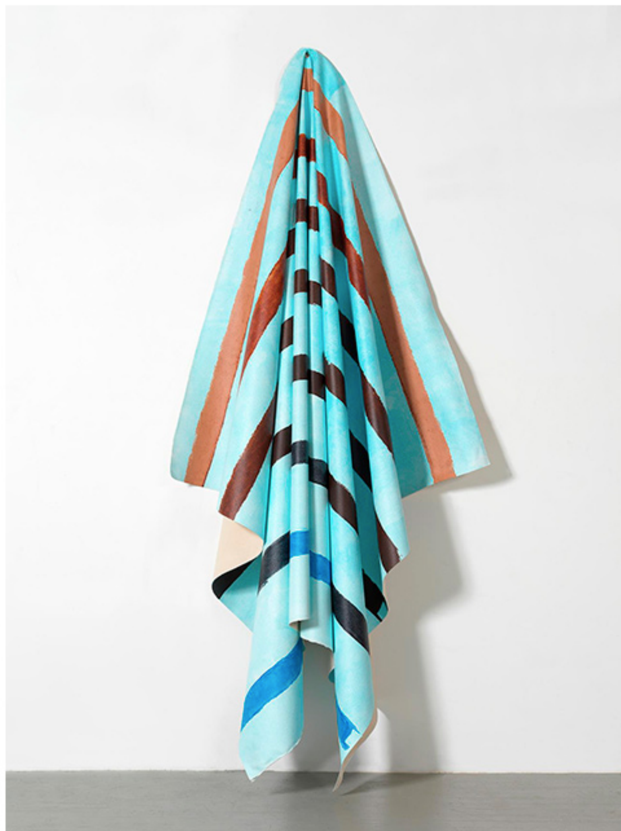
Tariku Shiferaw, African Queen (2Baba), 2020. Acrylic on canvas, 92 x 40 x 17 inches (233.7 x 101.6 x 43.2 cm).