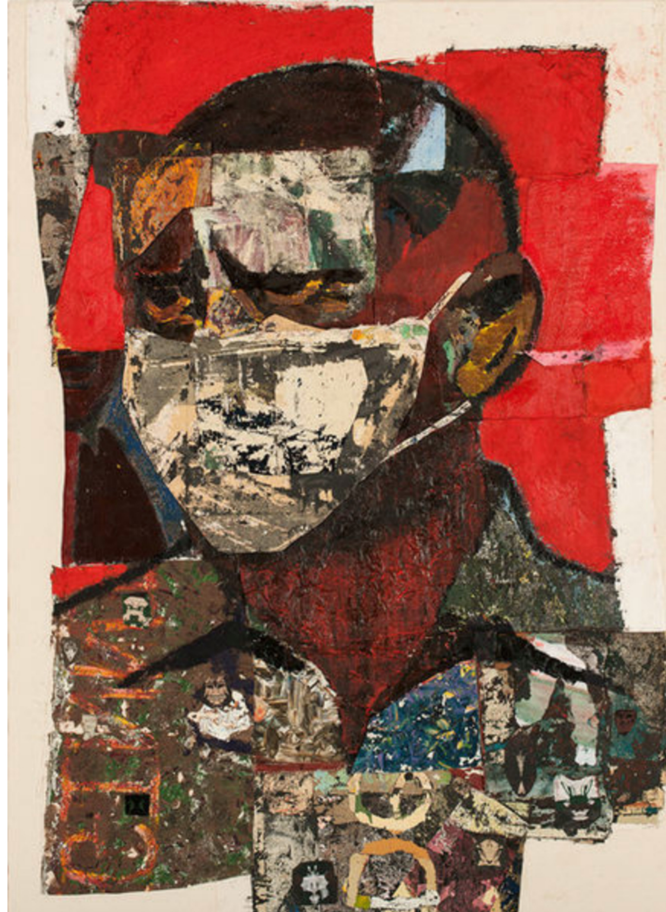
Artwork by Ermias Kifleyesus