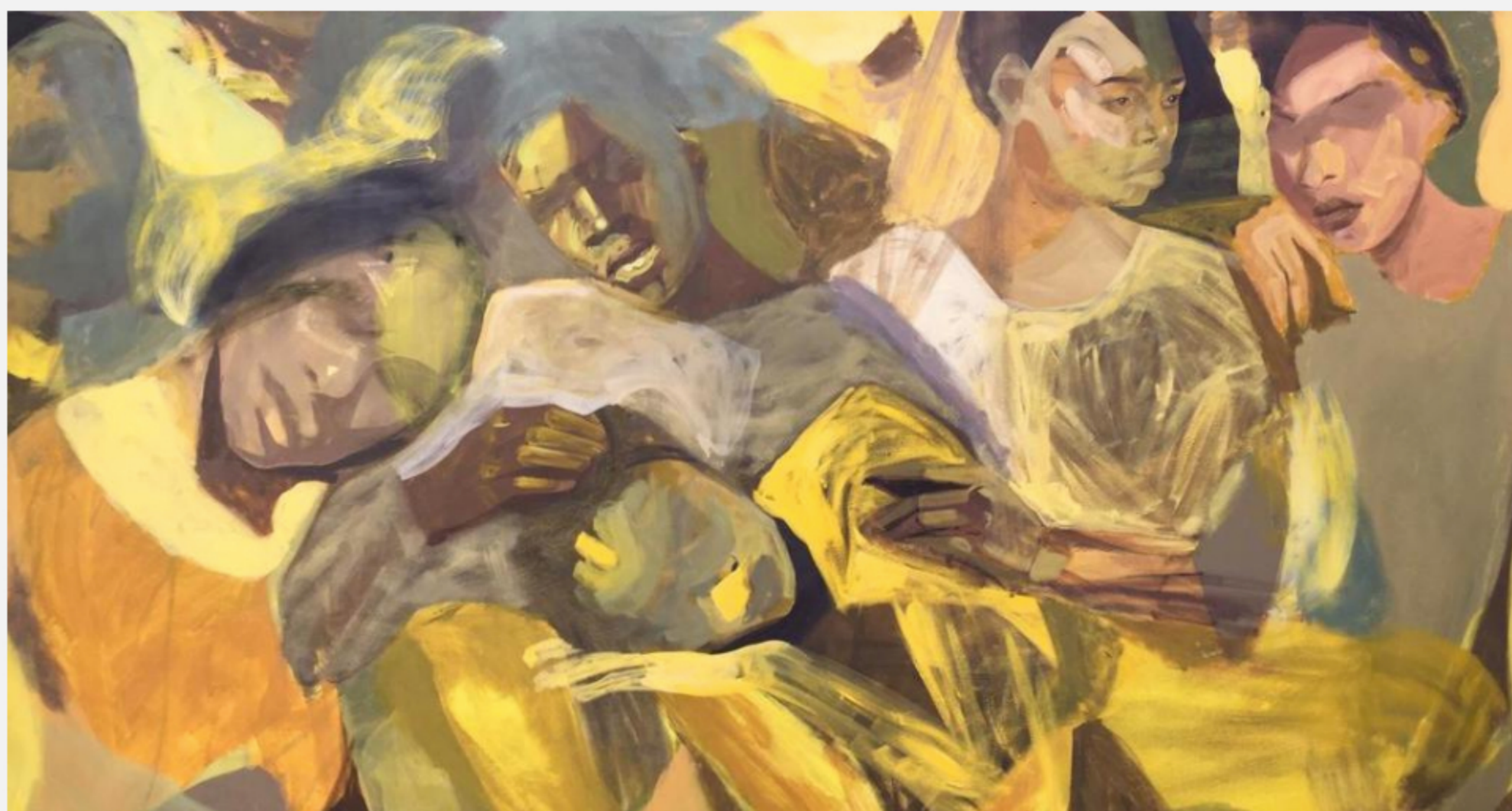
Hands