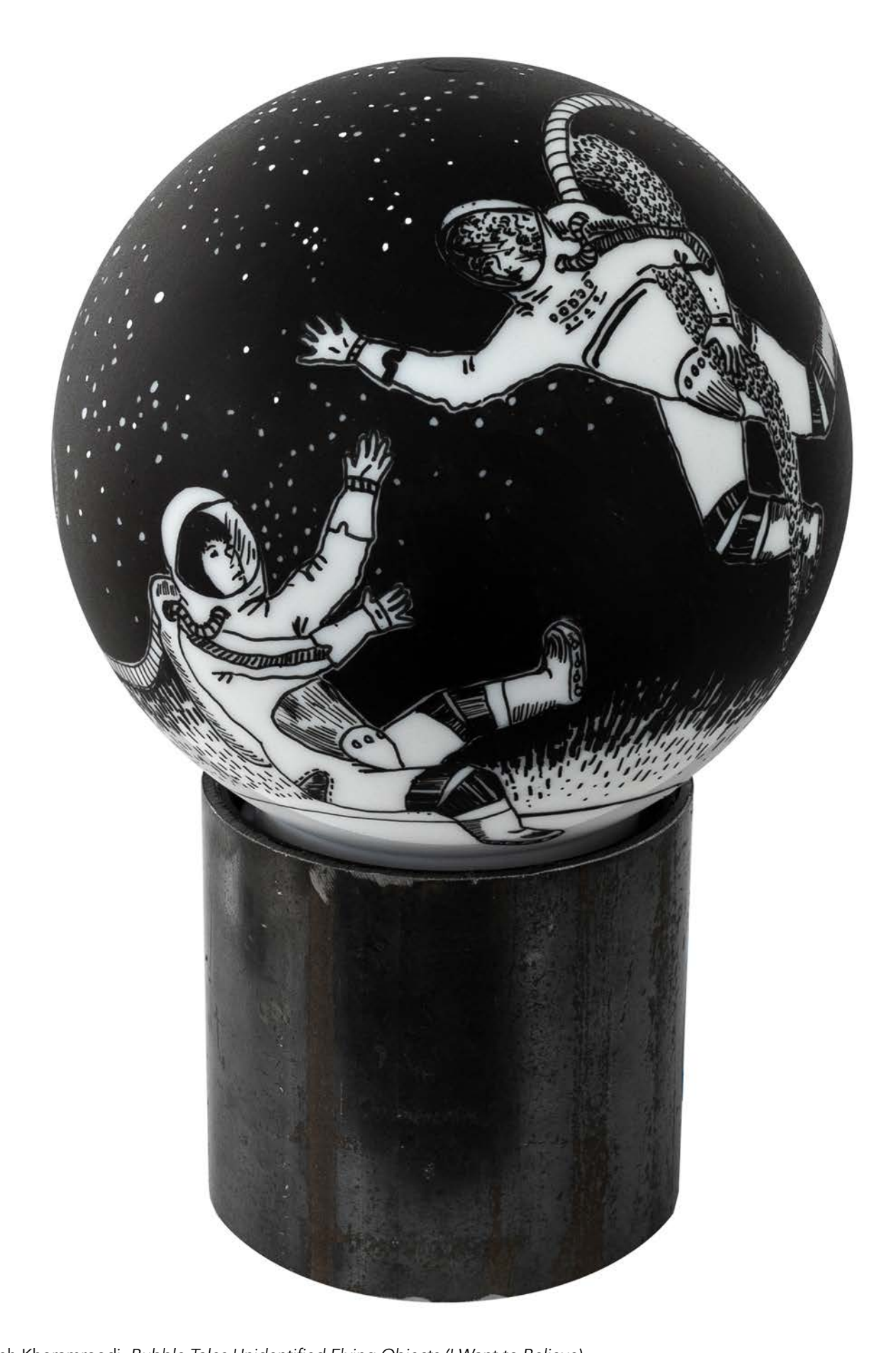
Taba Fajrak & Shokoofeh Khoramroodi. Bubble Tales Unidentified Flying Objects (I Want to Believe) 2018. Rapid ballpoint pen and marker on acrylic globe, iron stand, light bulb, lamp holder, electric circuits, wires. Globe: 16cm, stand: 11 x 14cm. Image courtesy of the artist and Dastan's Basement. © Taba Fajrak & Shokoofeh Khoramroodi