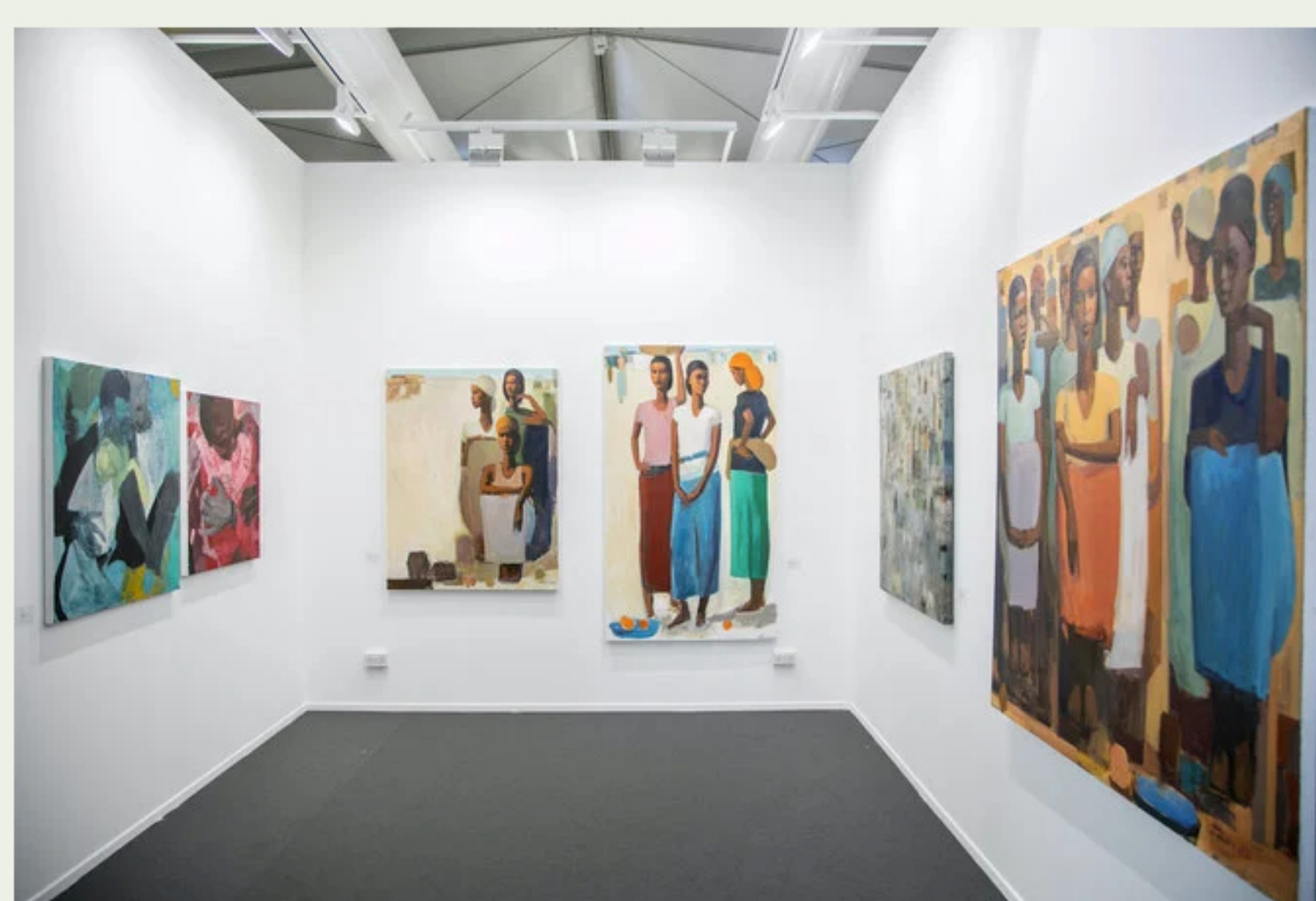
Among the participating galleries at Art Dubai is Addis Fine Art gallery, which has set up a booth at the event for the fourth year.