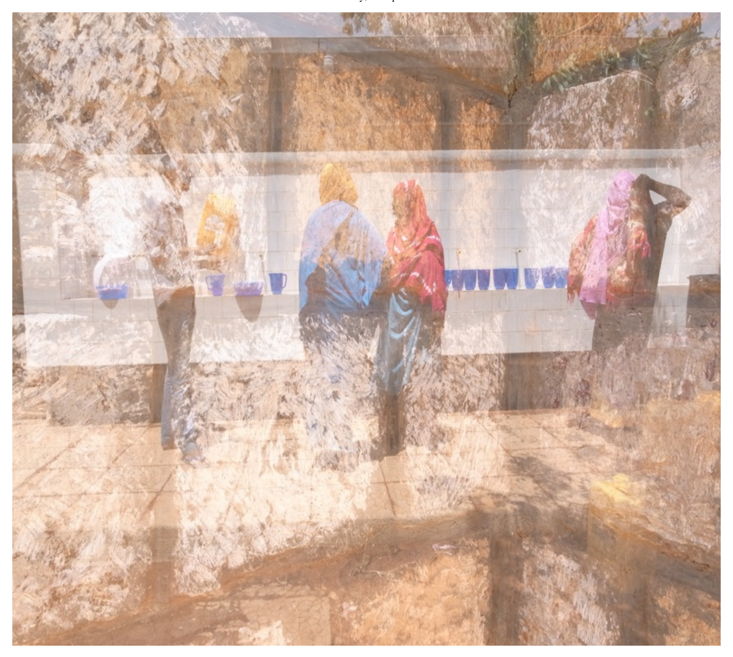
Colors of Ethiopia Series, 2014.

Using the checkerboard motif that appears throughout his work, Nahusenay probes the Biblical passage, which illustrates the drunken gambling and revelry that took place underneath the cross during the Crucifixion. Using rows upon rows of black and white squares and etchings, he takes this meditation to a more secular context, as the alternating squares sinuously trace the calm repose of a woman seated behind a café table, clasping her mobile phone.