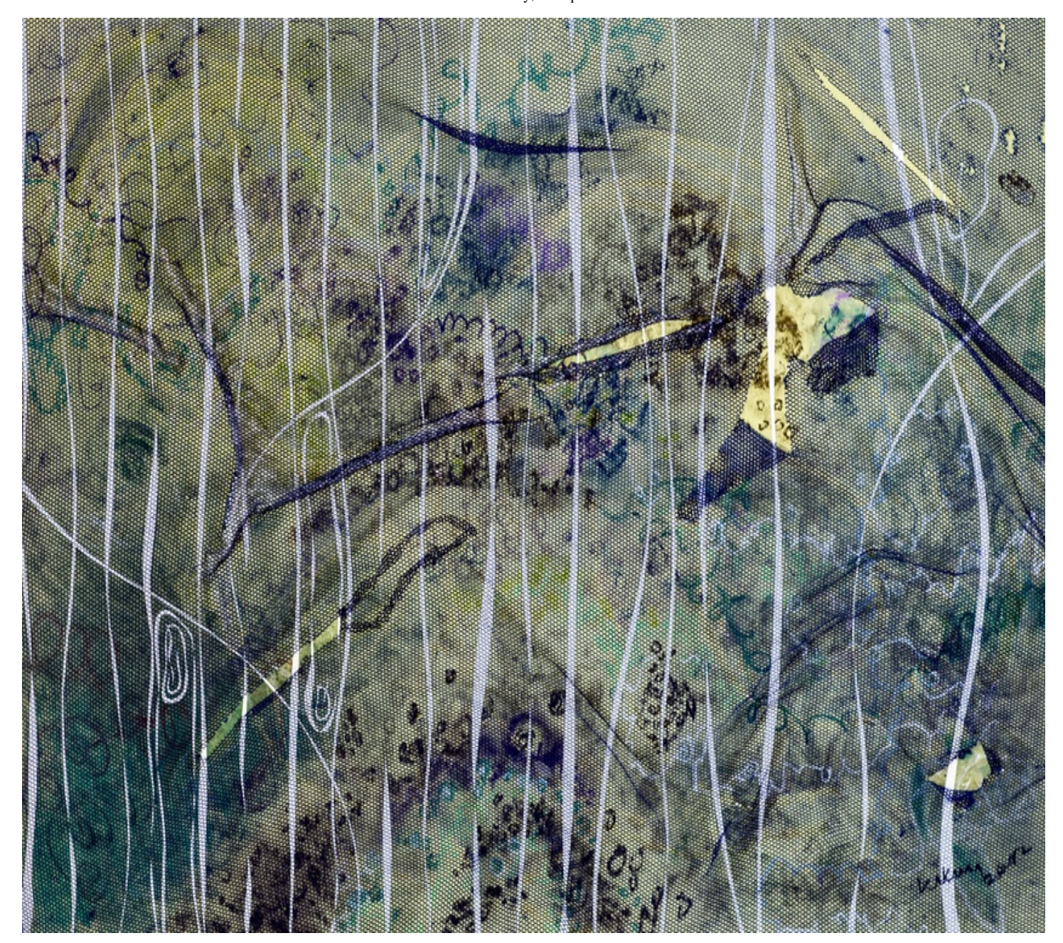
Jeb Wolede I, 2016.

In his photography, the use of double exposure, collage, and scratch-and-peel methods allows Nahusenay to create irreproducible, dreamlike worlds in which the spiritual ostensibly strains against, and spills into, the physical. The ghostlike rendering of a busy street scene hollows out the solid but battered exterior of a green and yellow public bus, in turn allowing us a glimpse into its inner function. A colorful market scene curdles and coagulates—its participants juxtaposed against the raw grains they will soon consume.