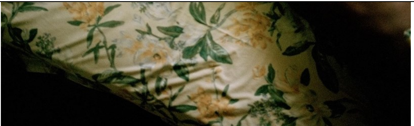
Untitled, 2014