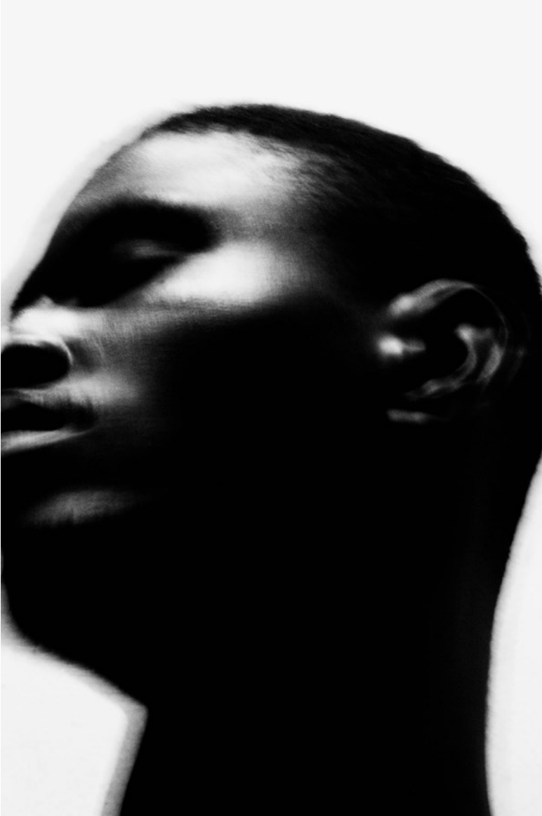
Head, 2014