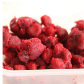
The Definitive Food Guide for Mombasa