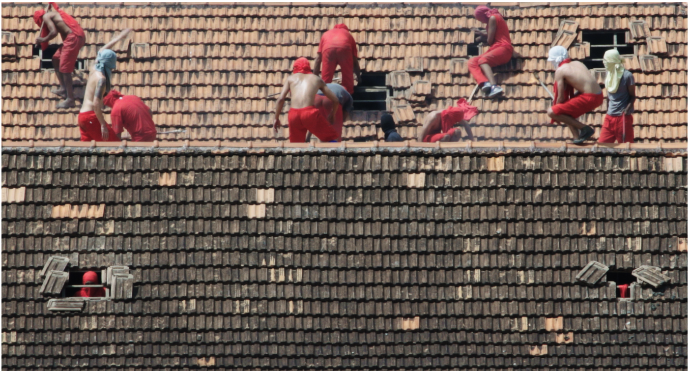
Cinthia Marcelle, NAU / NOW , 2017, video, 44'loop, Courtesy of Vermelho.