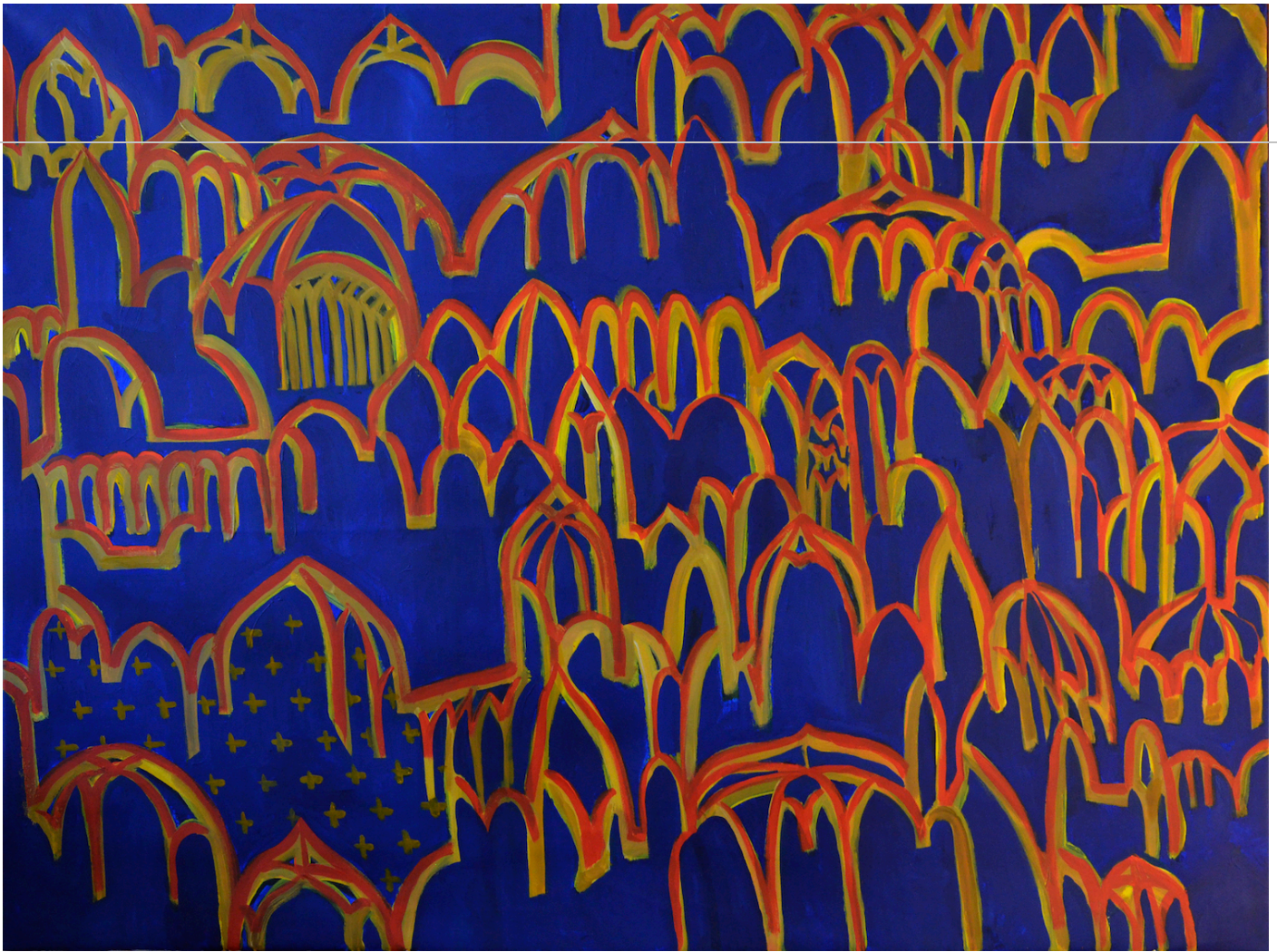
Bakhyt Bubikanova, Copy 4.0 , 2018, acrylic on canvas, 140 x 190cm, Courtesy of Aspan Gallery.