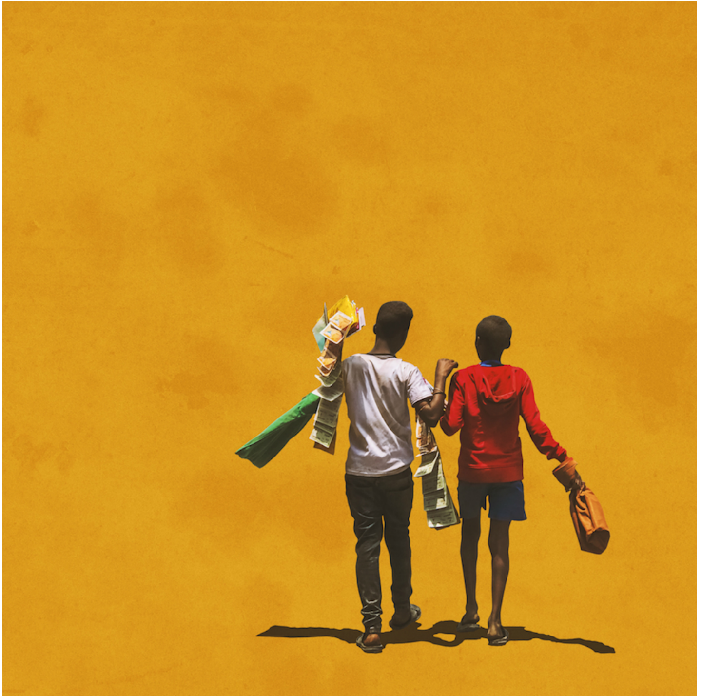
Girma Berta, Moving Shadows II, X , 2017, Digital archival print, 40 x 40 cm.

Through its two-artist presentation at the fair, Addis Fine Art ( https://addisfineart.com/ ) is set to reveal an intimate selection of vibrant digital prints by the Ethiopian photographer Girma Berta (b. 1990). Through his narrative-driven series, Moving Shadows (2016-17), the observant and self-taught Berta seeks to document the streets of his native Addis Ababa in all its forms: 'the beautiful, the ugly and all that is in between.' On the other hand, works by Ethiopian-born, San Francisco-based Wosene Worke Kosrof (b. 1950) offer viewers a fascinating insight into the artist's attempt to transfigure his native Amharic script into abstract art. From London, returning gallery TAFETA ( http://www.tafeta.com/ ) will present a solo display of works on paper and sculptures by the Nigerian-born artist Victor Ekpuk (b. 1964), who explores the multi-layered and timely themes of politics, gender, and culture.