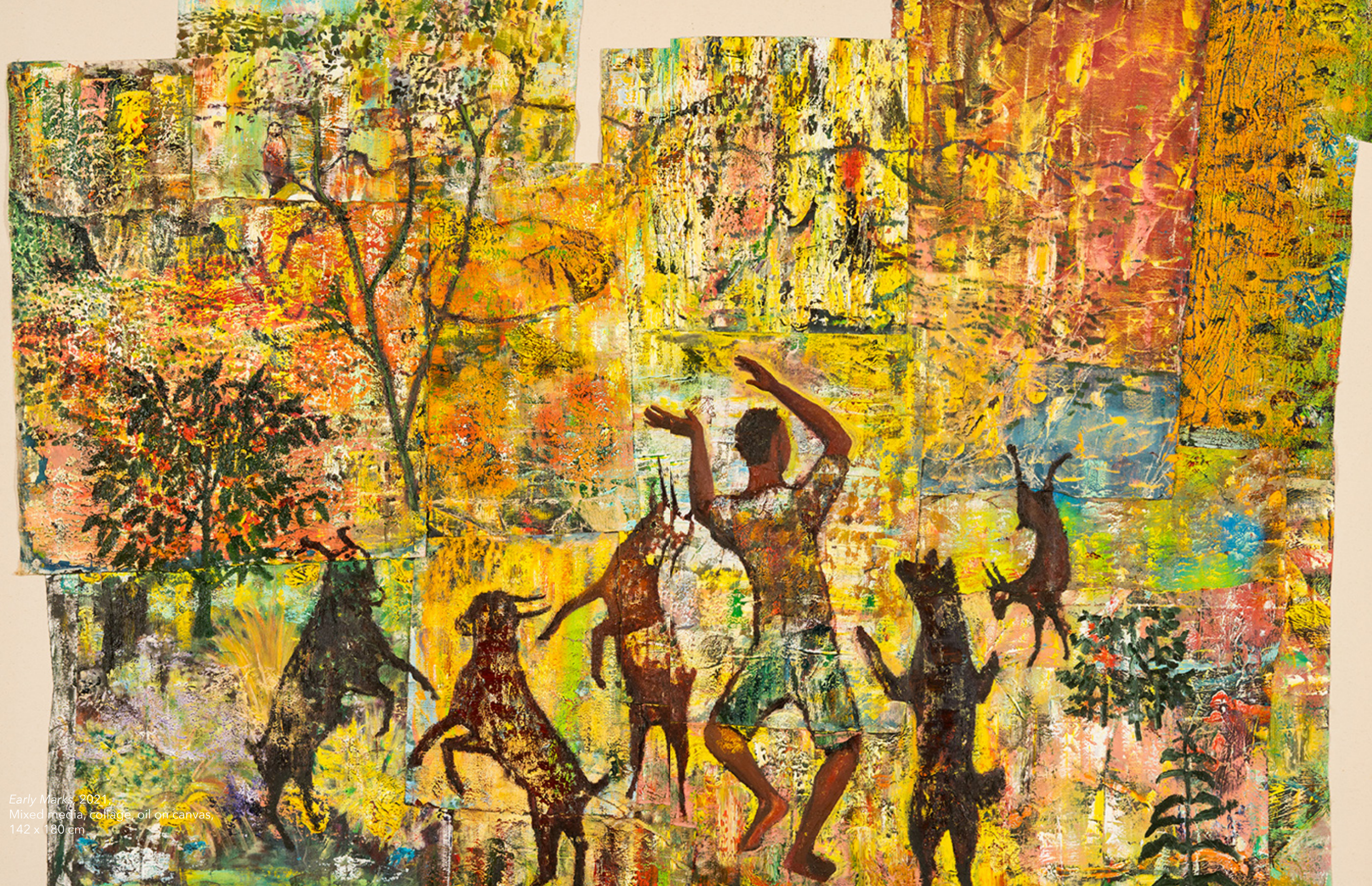
Early Marks , 2021, Mixed media, collage, oil on canvas, 142 x 180 cm