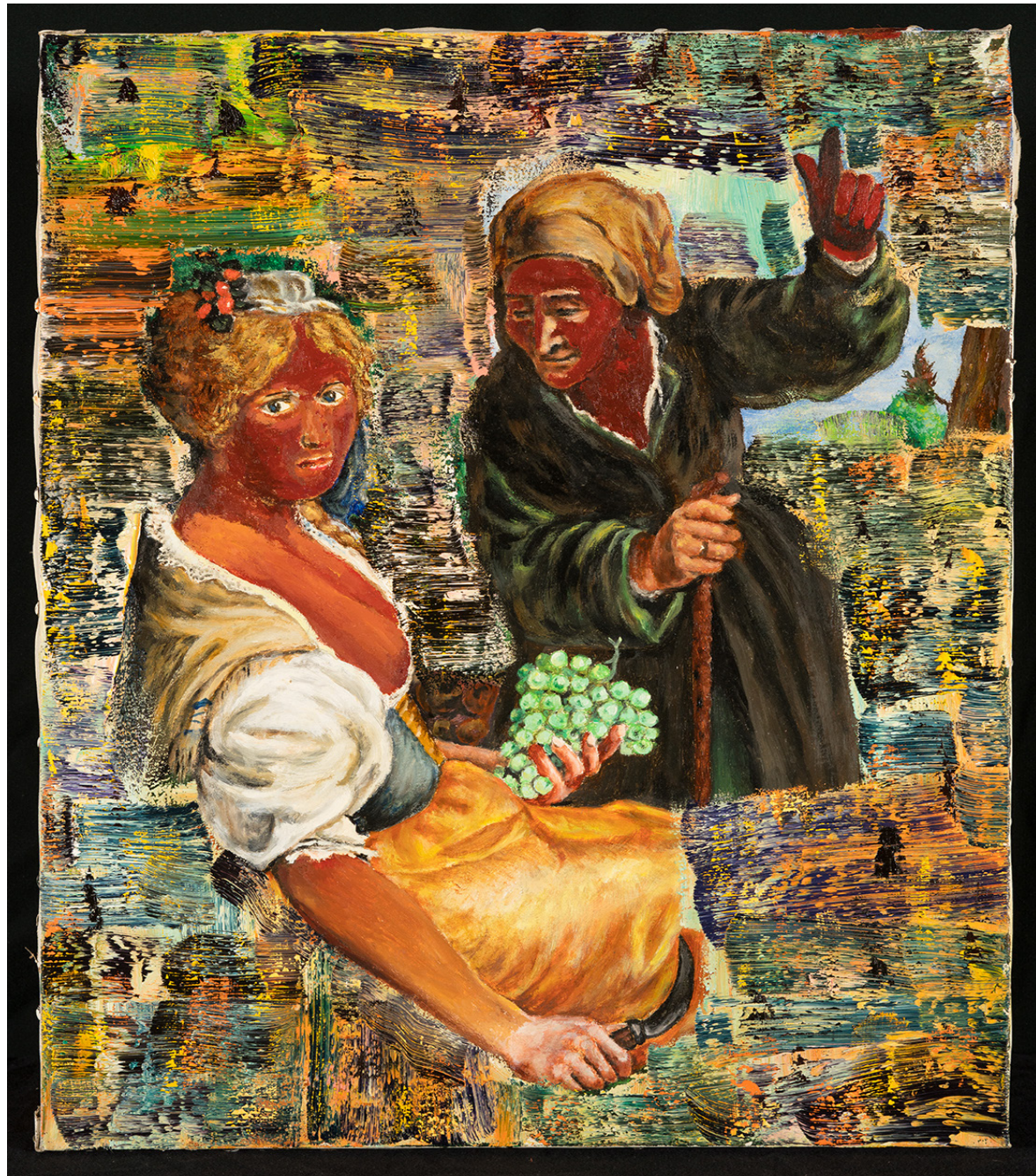
Valiant, 2021 Mixed media, collage, oil on canvas 65 x 51 cm