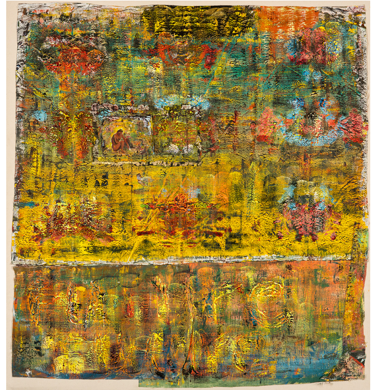
Denkenesh, 2021 Mixed media, collage, oil on canvas 106 x 90 cm