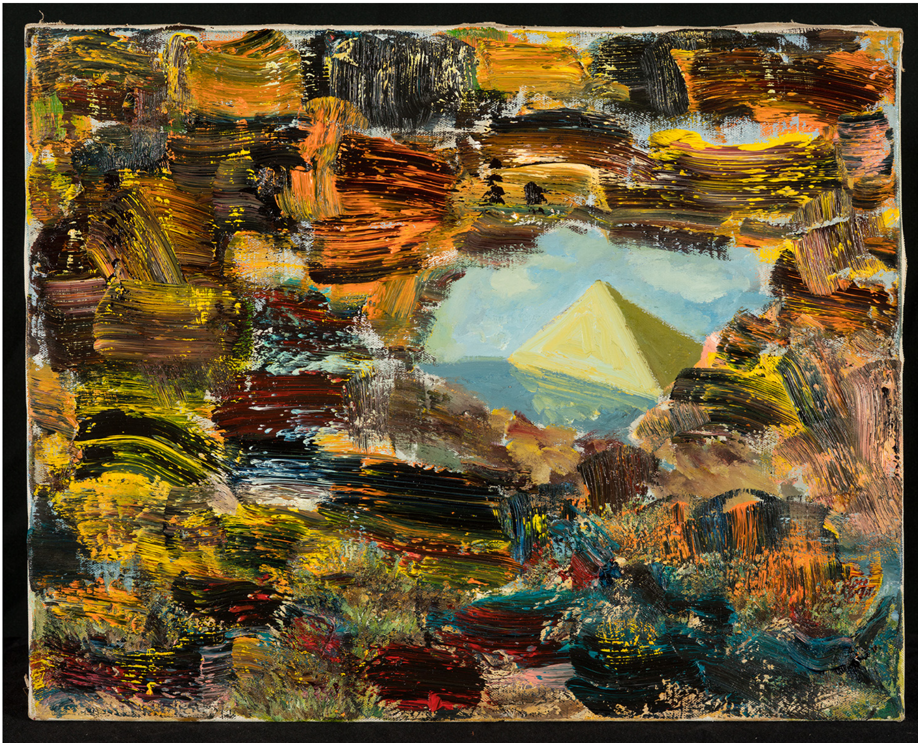
Apostle , 2021 Mixed media, collage, oil on canvas 40 x 50 cm