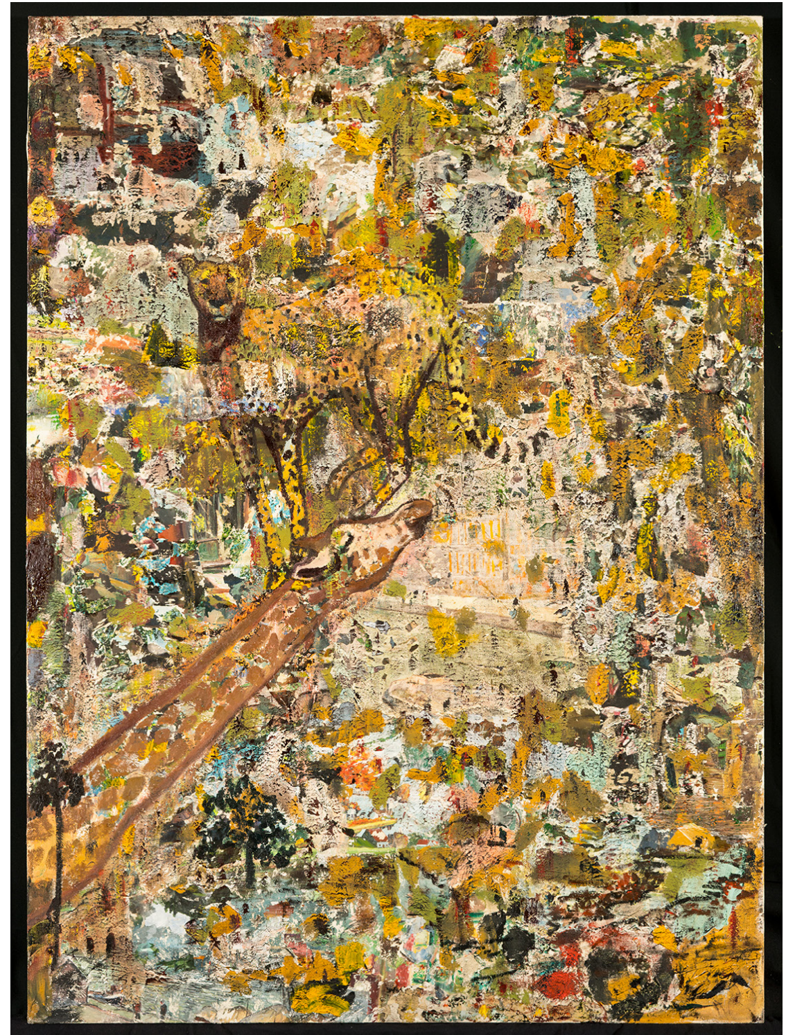
Pareidolia , 2021 Mixed media, collage, oil on canvas 184 x 132 cm