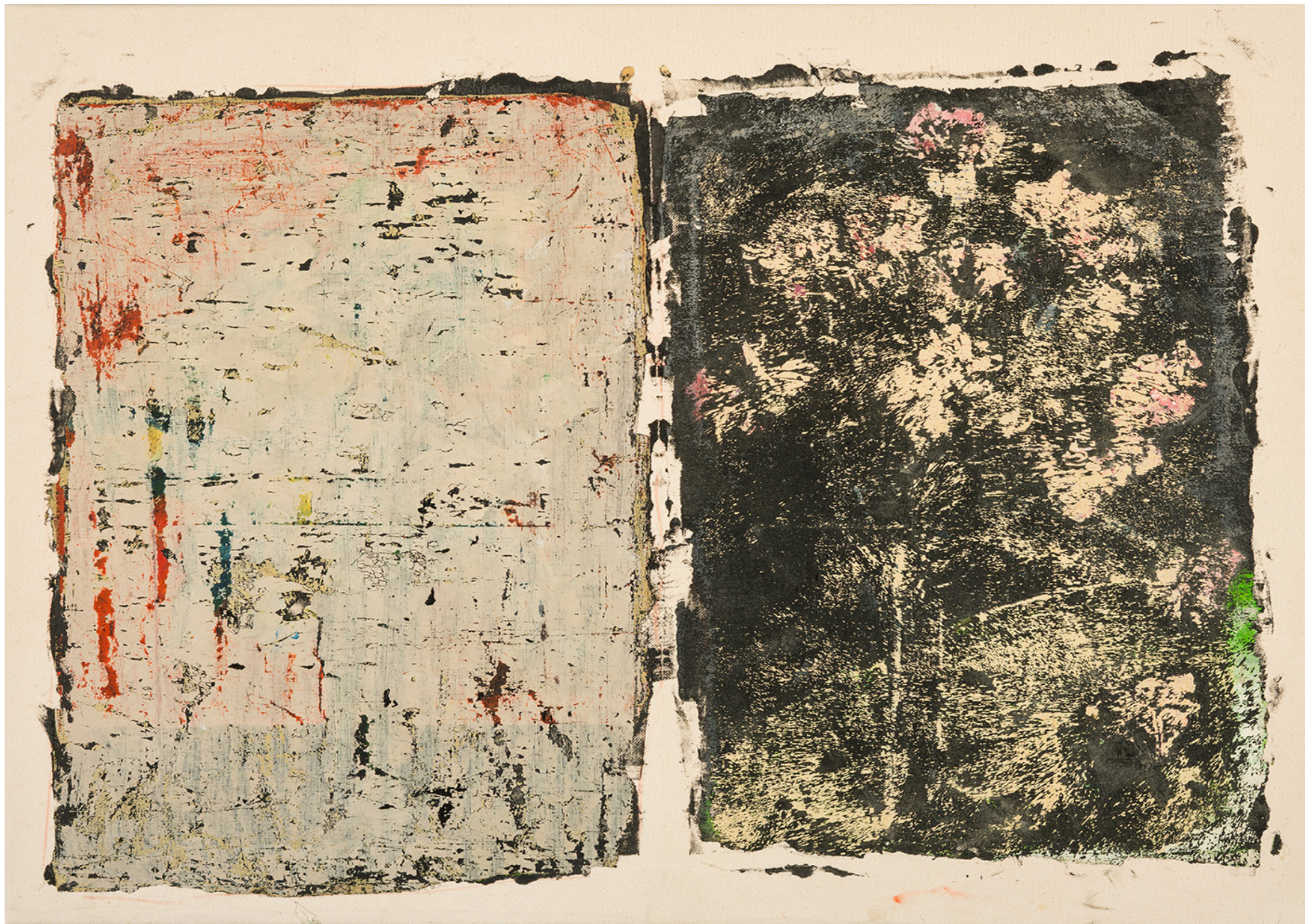
Mythos , 2021 Mixed media, collage, oil on canvas 70 x 90 cm