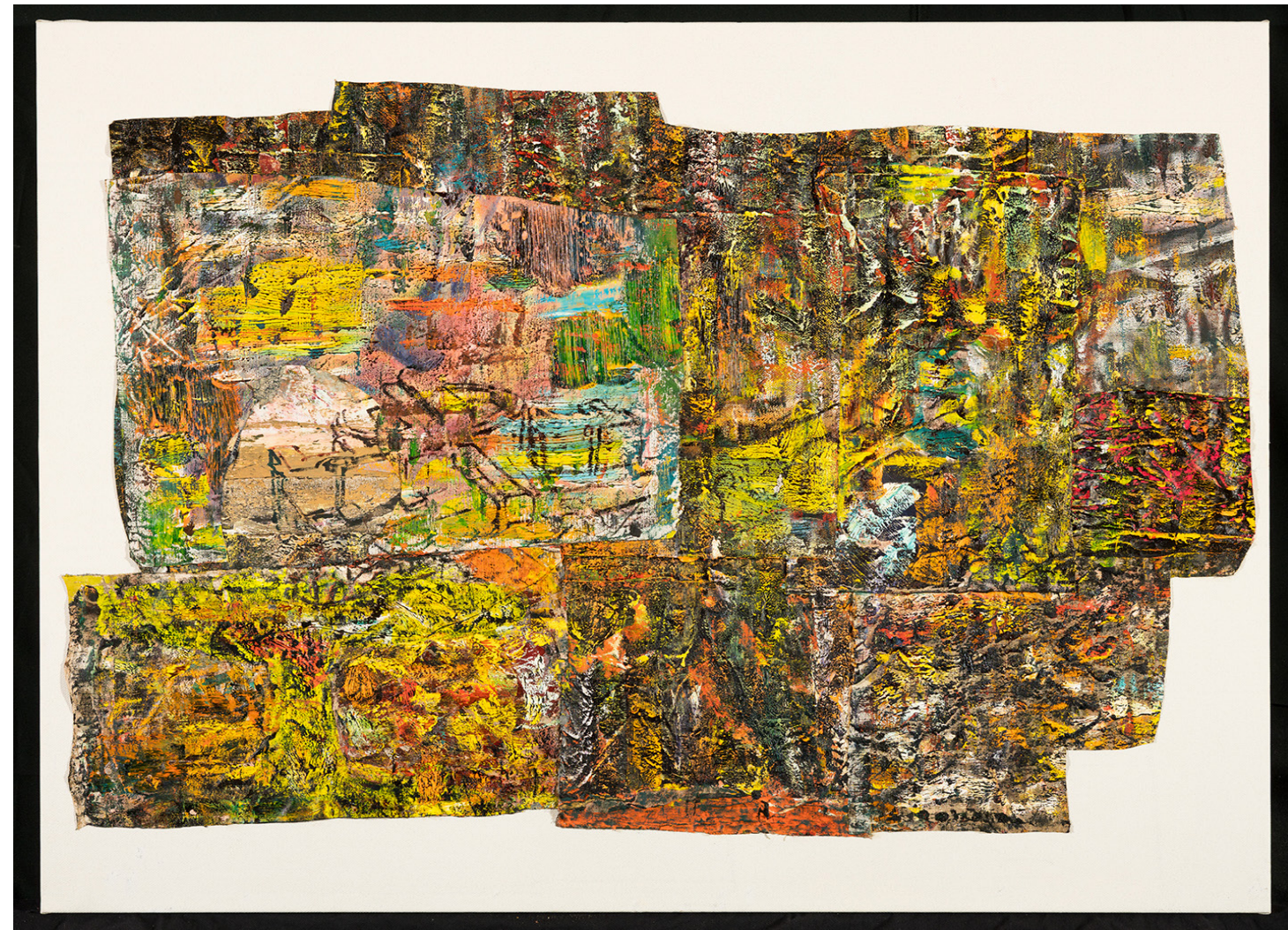
Powersite, 2021 Mixed media, collage, oil on canvas 104 x 130 cm