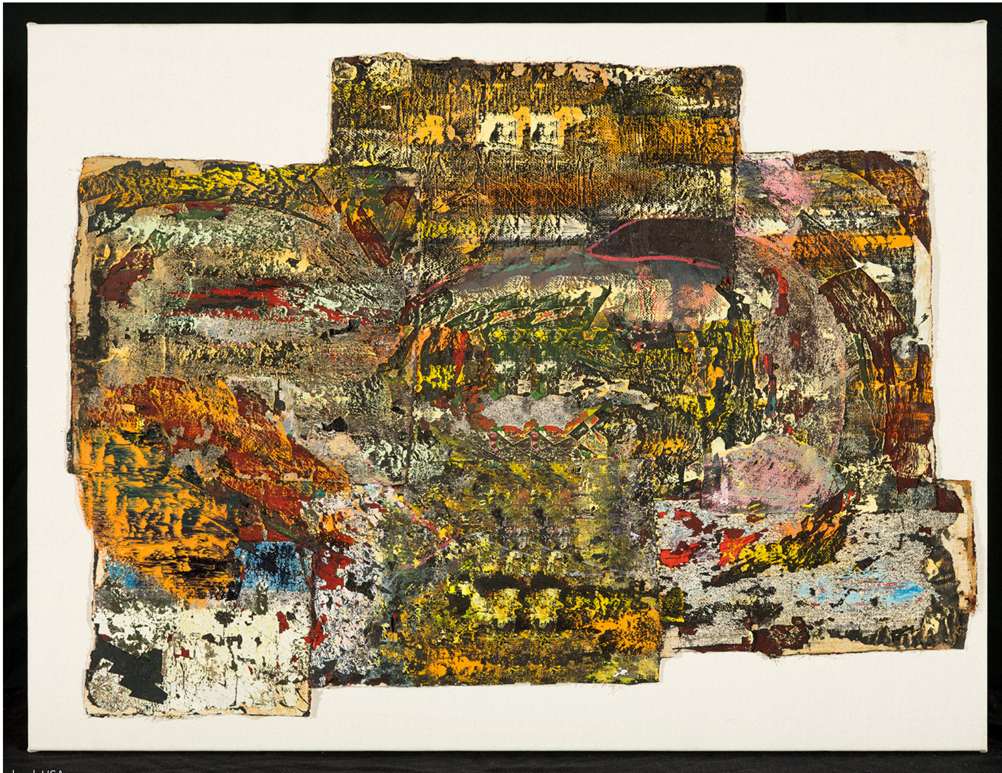
Perseverance , 2021 Mixed media, collage, oil on canvas 60 x 76 cm