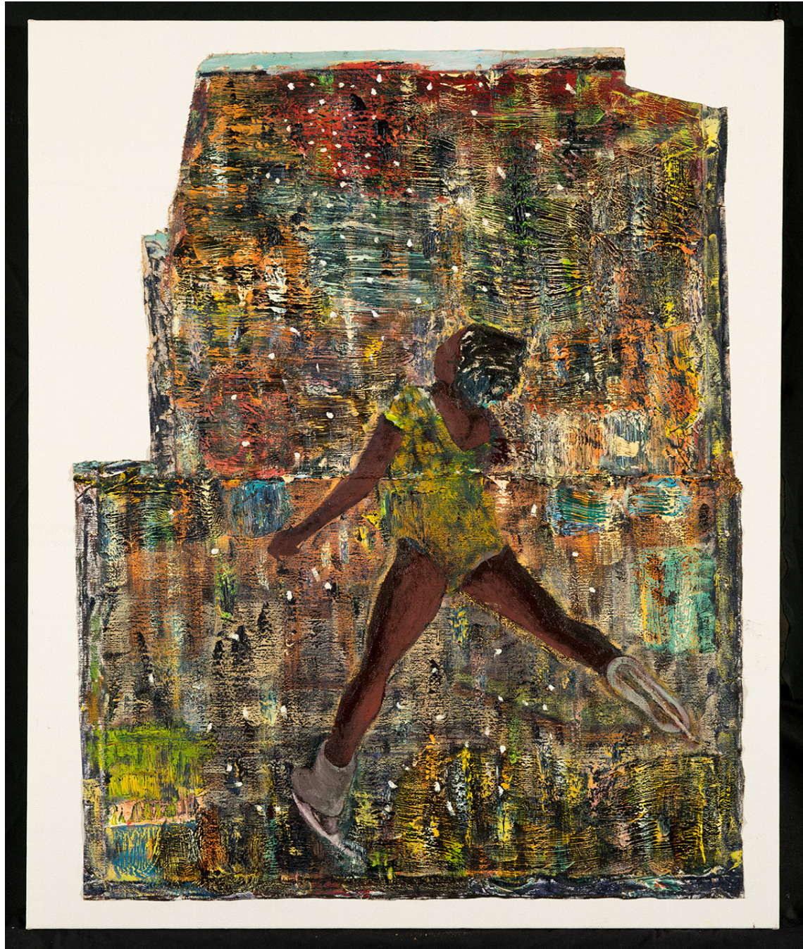
One Blade , 2021 Mixed media, collage, oil on canvas 112 x 84 cm