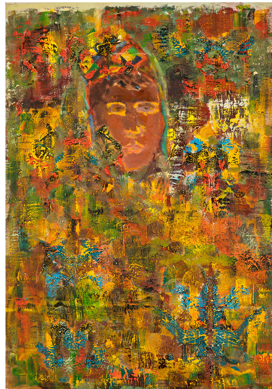
Dallol, 2021 Mixed media, collage, oil on canvas 70 x 48 x cm