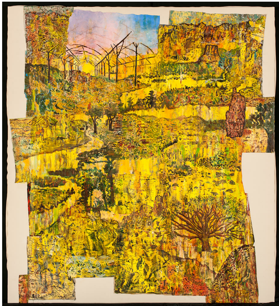
The Glasshouse and the Ants Hill, 2021 Mixed media, collage, oil on canvas 190 x 172 cm