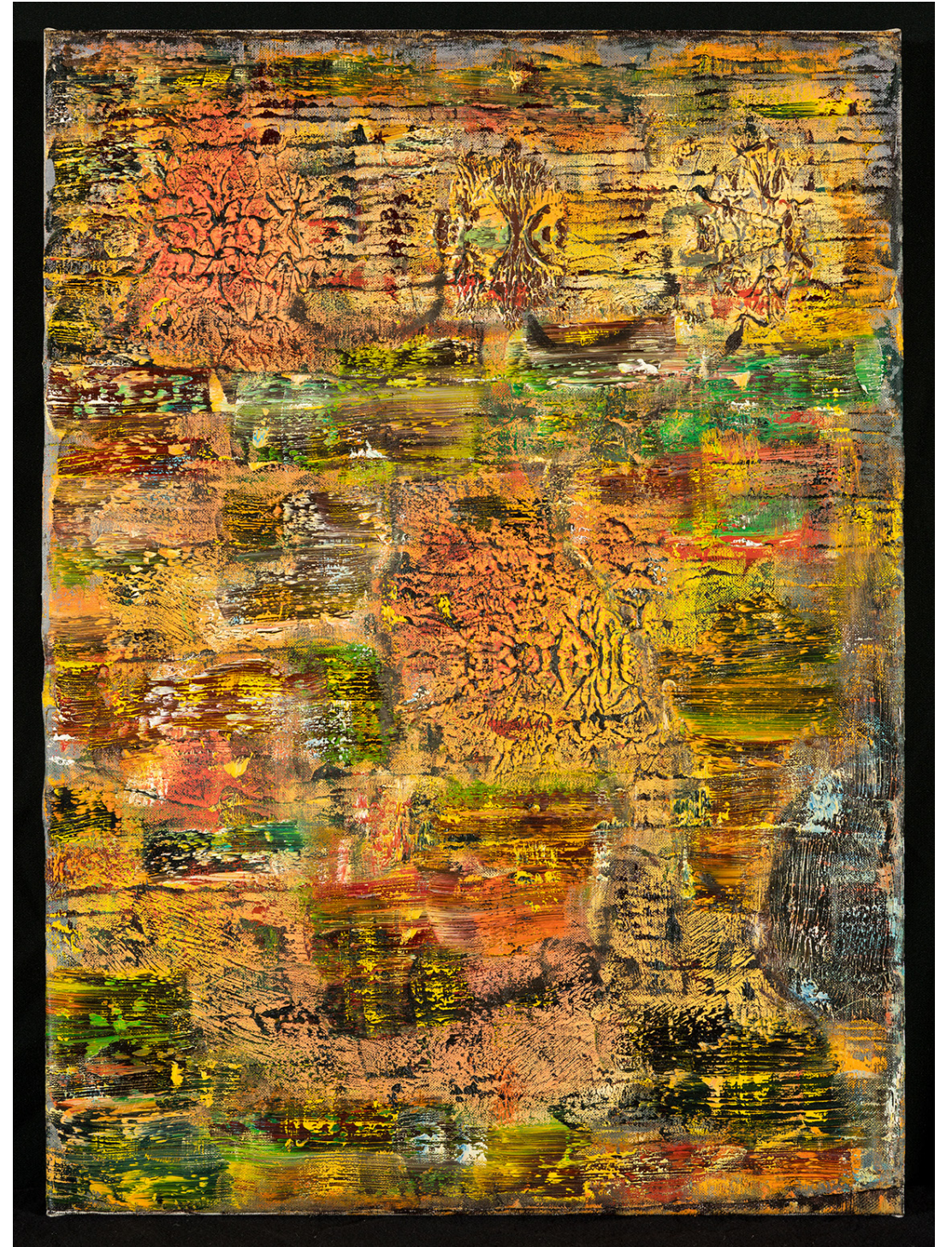
Farenji , 2021 Mixed media, collage, oil on canvas 73 x 52 cm