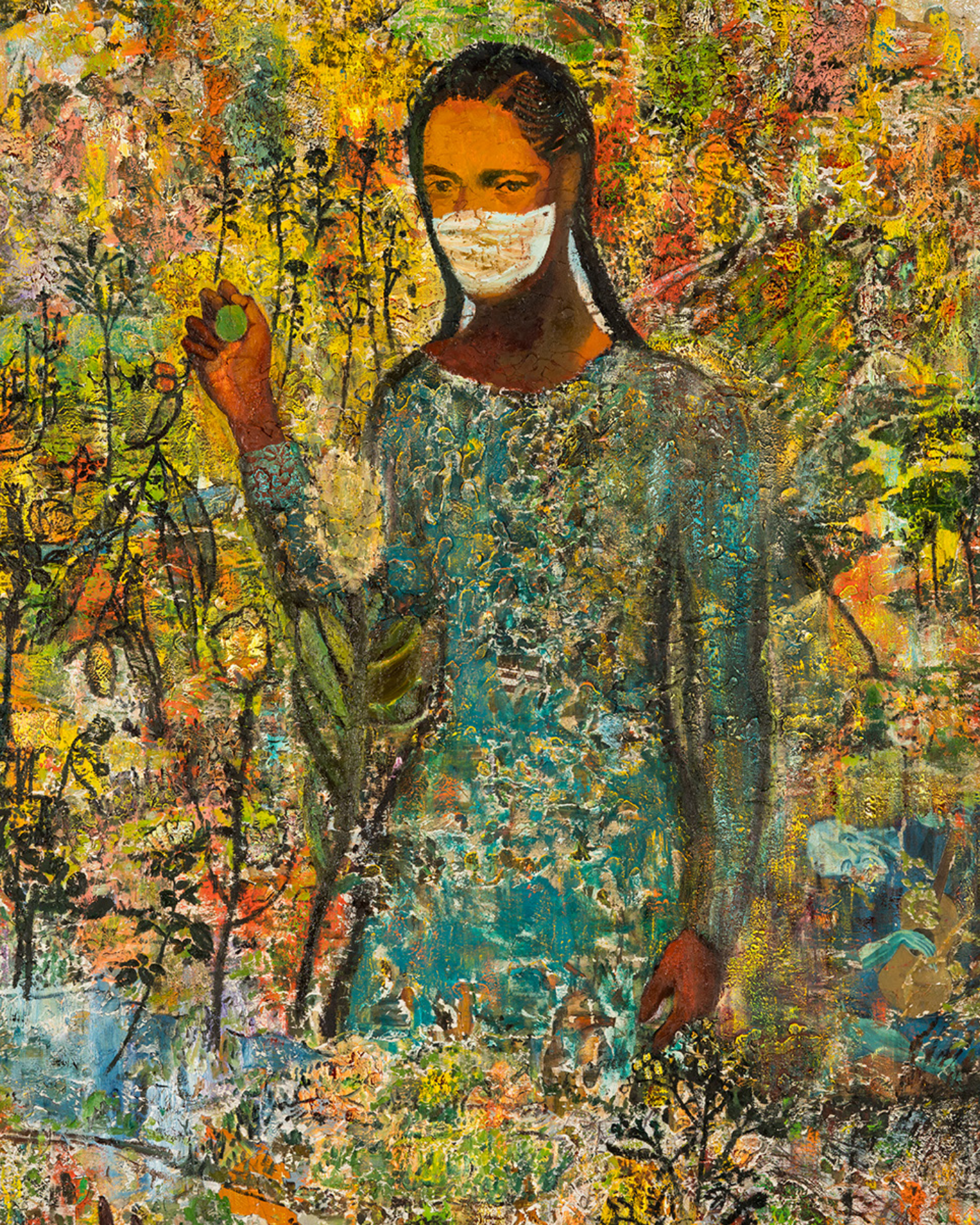
Exit, 2021 Mixed media, collage, oil on canvas 205 x 147 cm