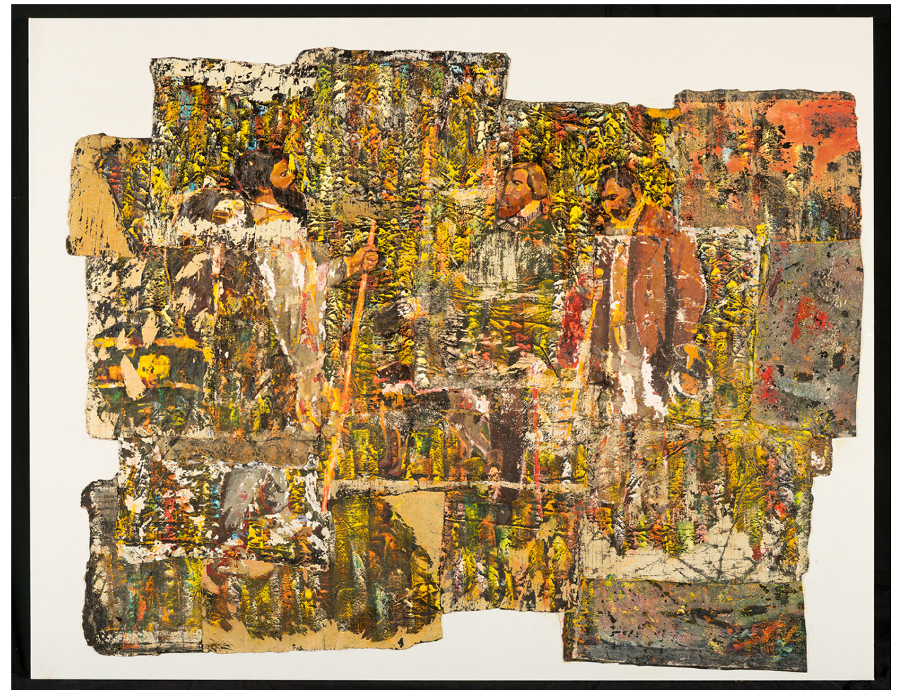
Regard, 2021 Mixed media, collage, oil on canvas 159 x 182 cm