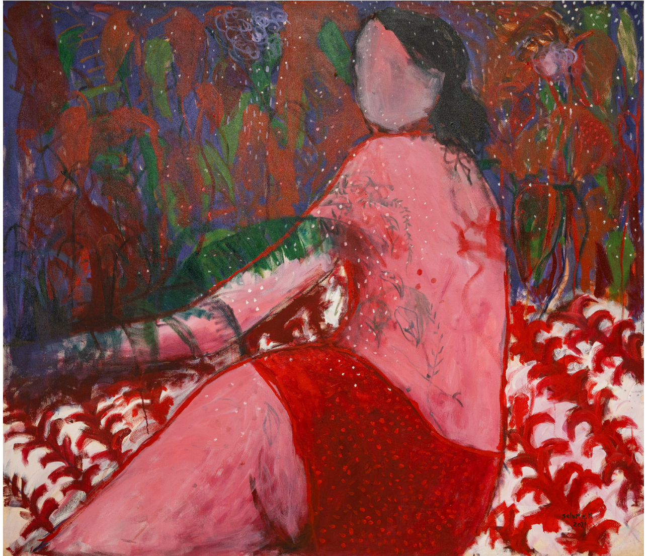
Collapsing Space VI , 2021 Acrylic and oil pastel on canvas 130 × 150 cm