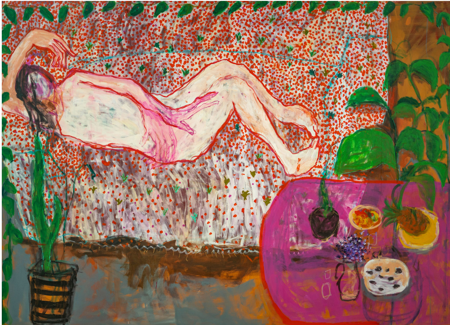
Collapsing Space IX , 2021 Acrylic and oil pastel on canvas 165 × 230 cm