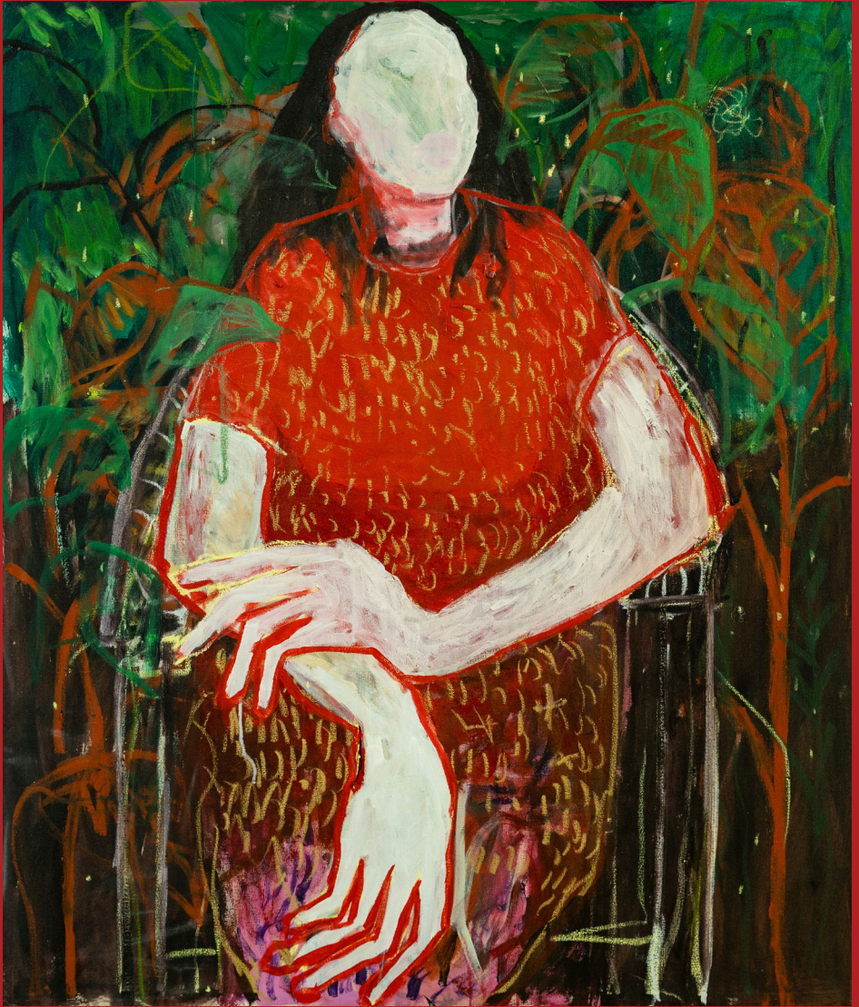
SELOME MULETA Collapsing Space