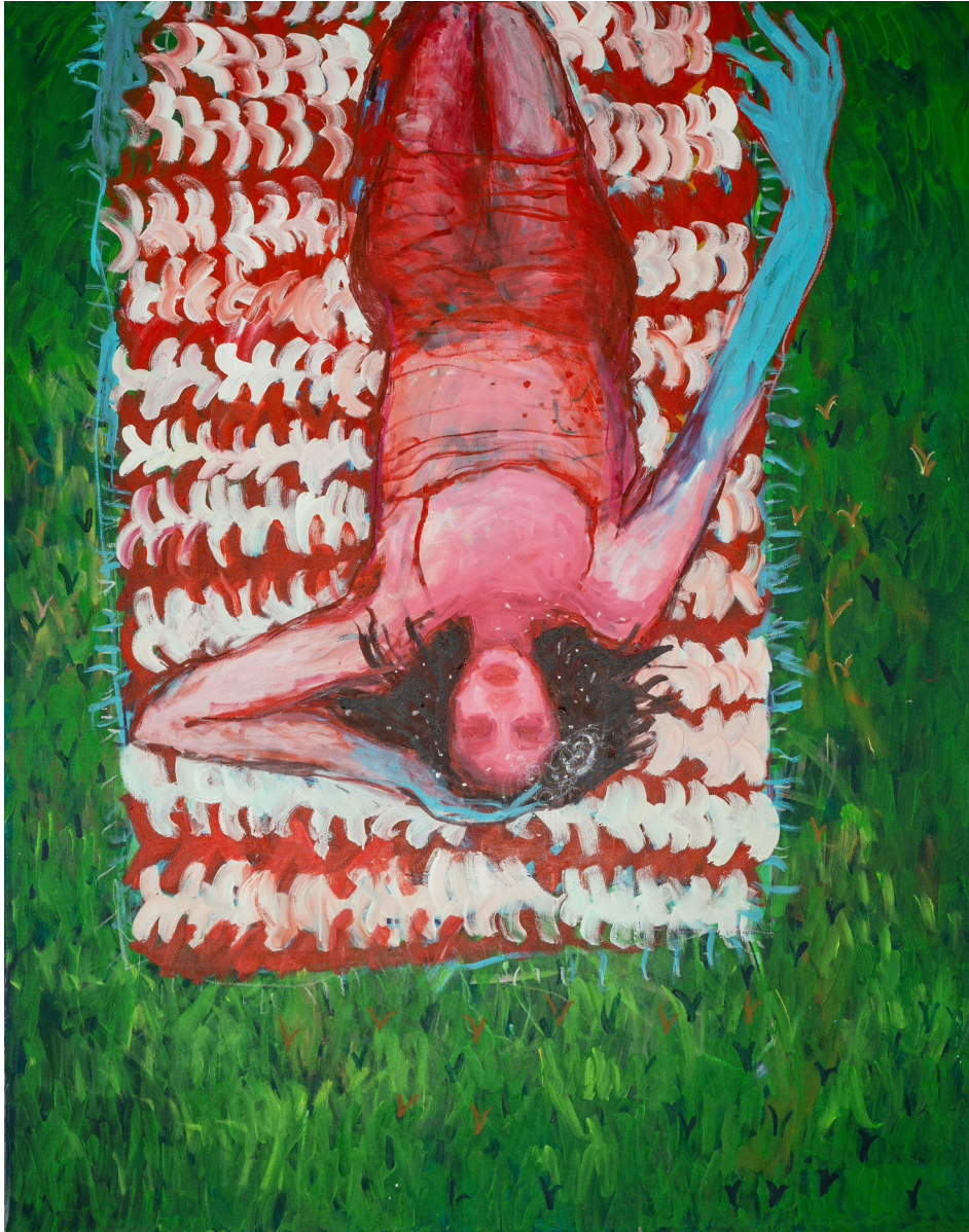
Collapsing Space VIII , 2021 Acrylic and oil pastel on canvas 210 × 165 cm