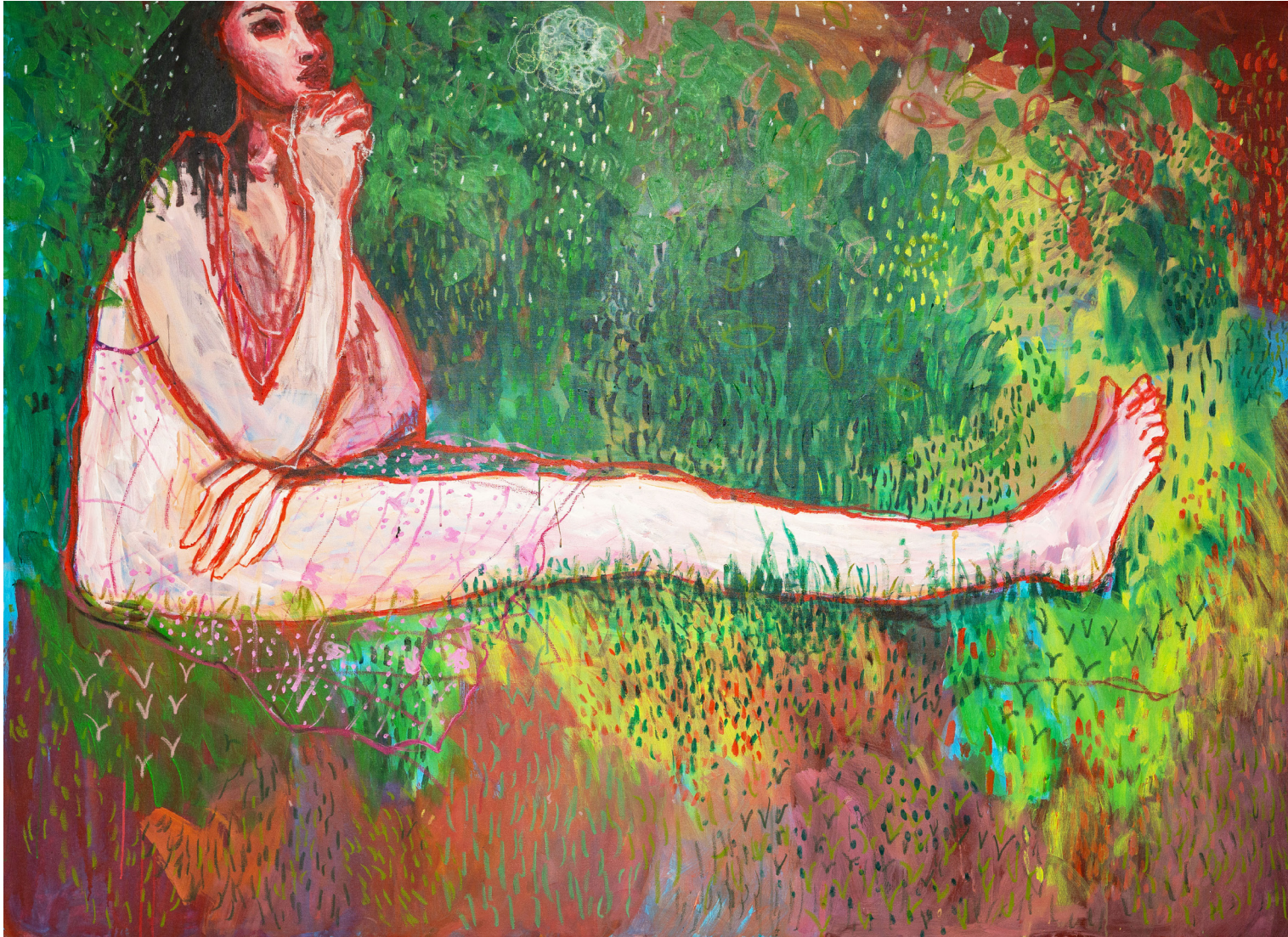
Collapsing Space X , 2021 Acrylic and oil pastel on canvas 165 × 230 cm